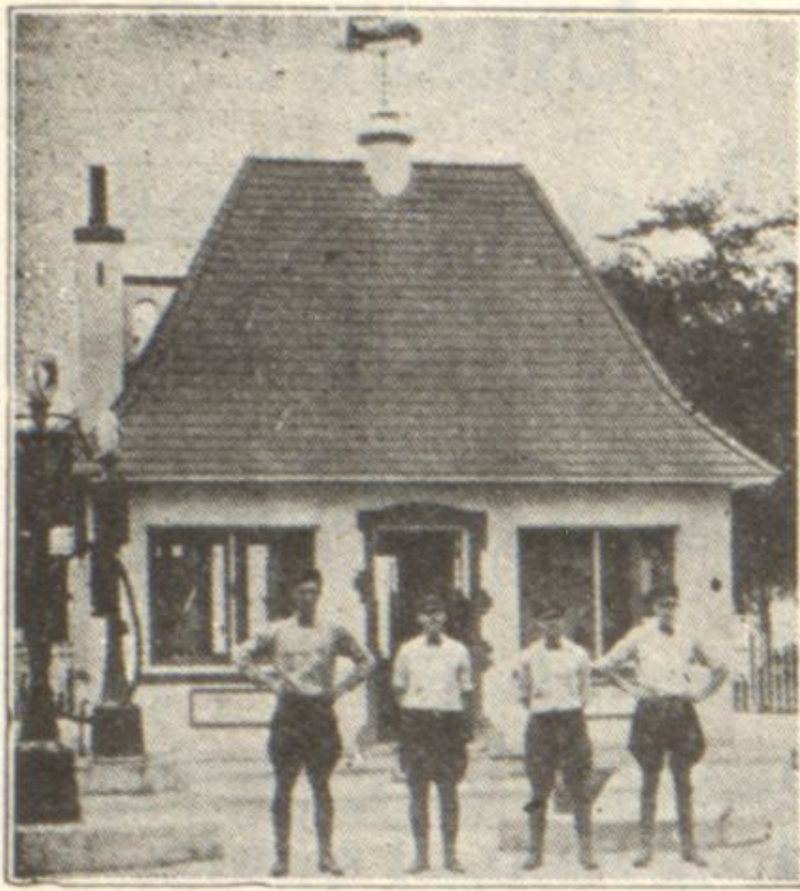
The Red Roof in No-Man's Land Just South of "The Cottage"

NOW—YOUR TRANSMISSION and DIFFERENTIAL DRAINED and FLUSHED with the NEW "FRY FLUSHER"