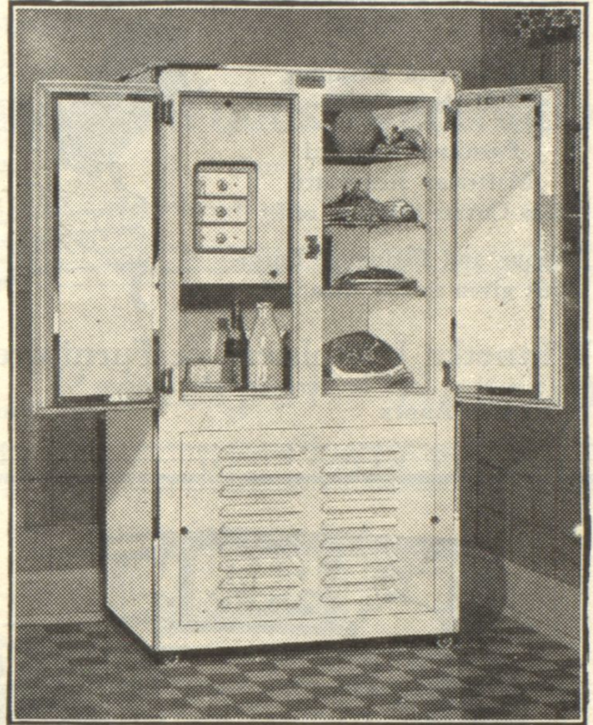
ZEROZONE MODEL B-7

Convert your present icebox into a ZEROZONE