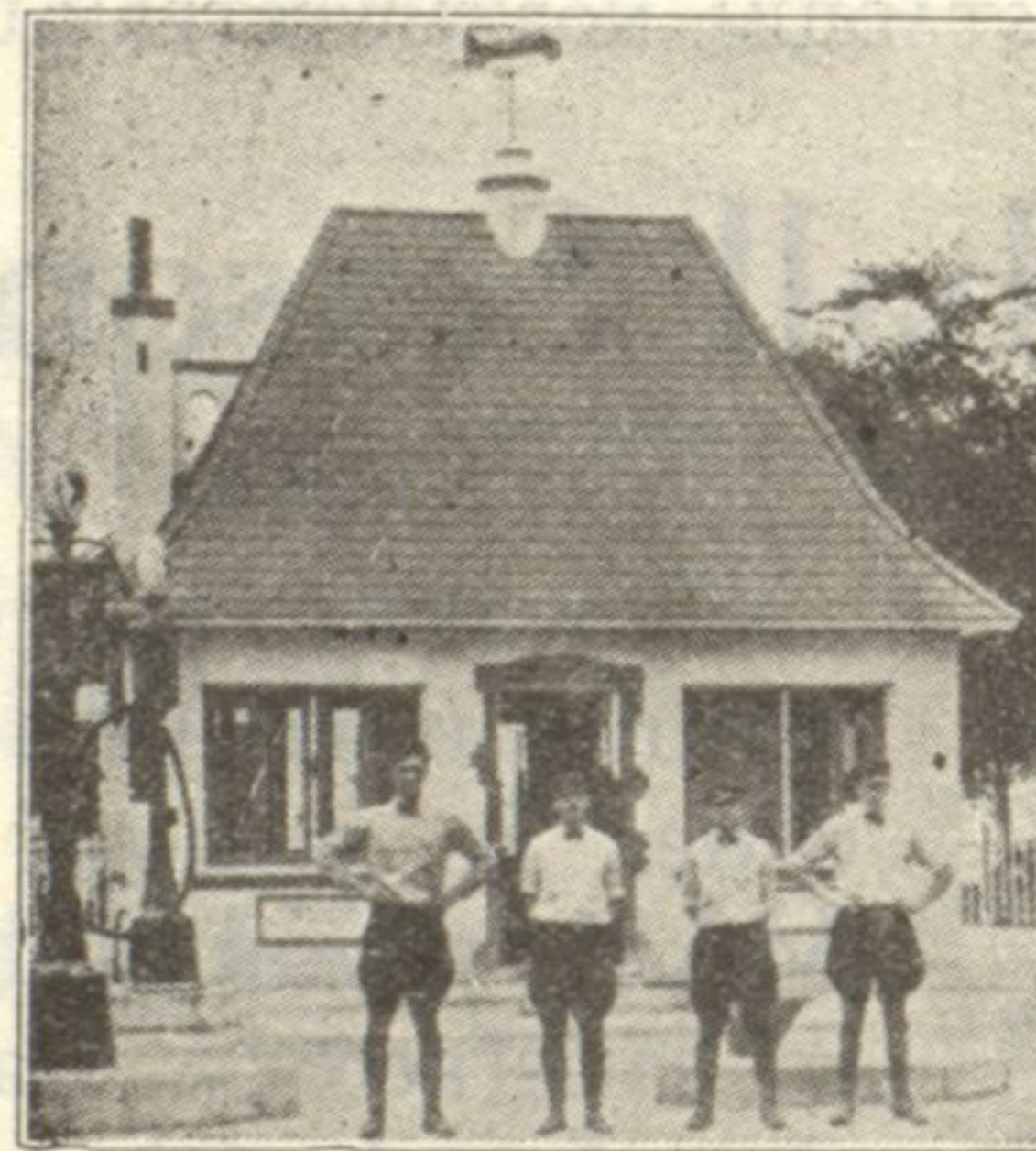
The Red Roof in No-Man's Land Just South of "The Cottage"