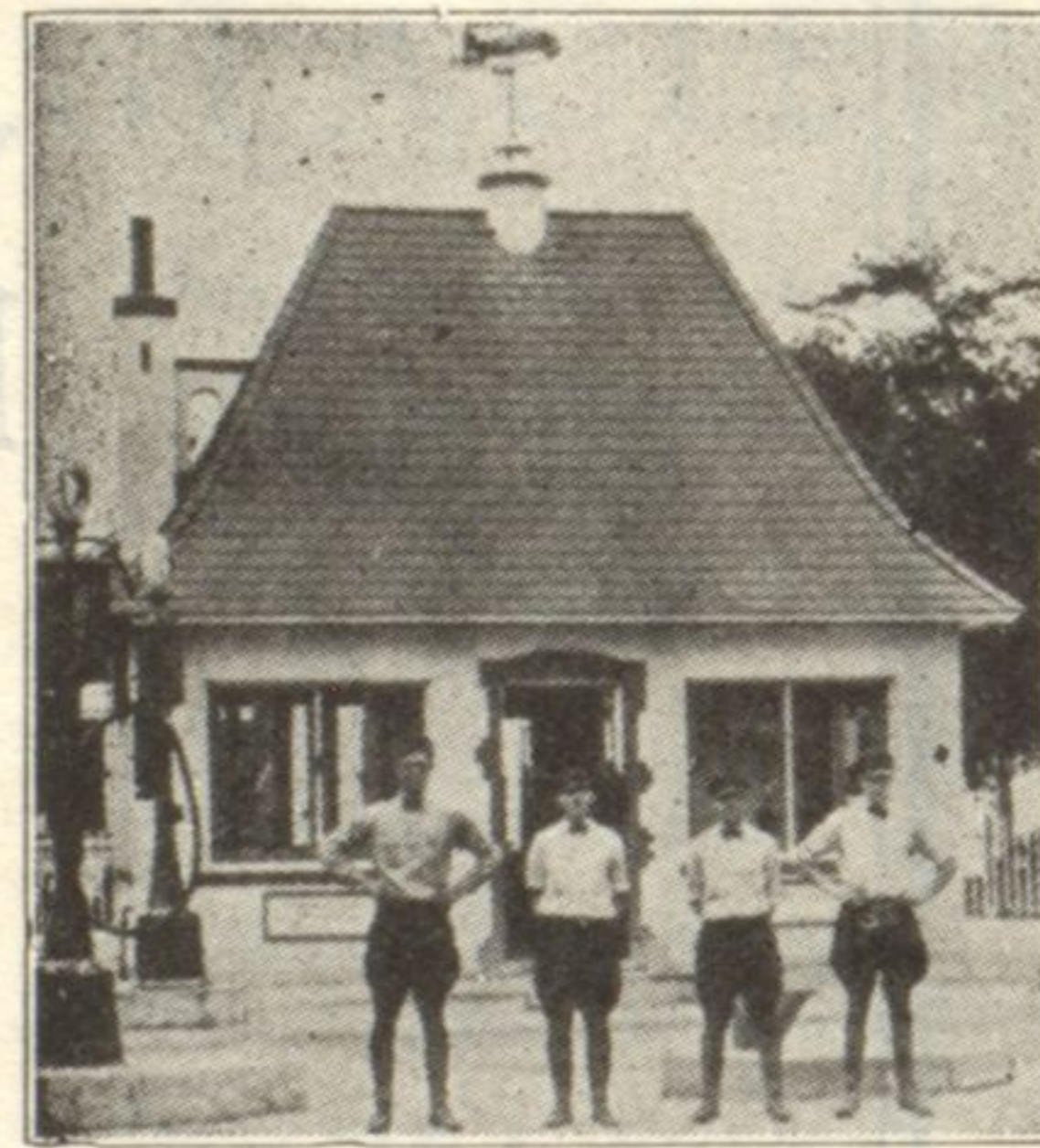
The Red Roof in No-Man's Land Just South of "The Cottage"