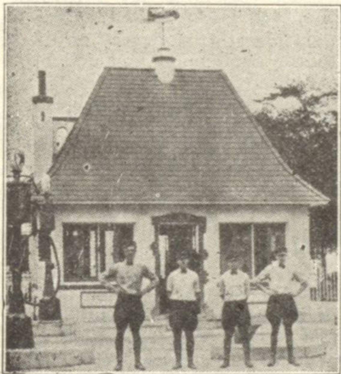
The Red Roof in No-Man's Land Just South of "The Cottage"