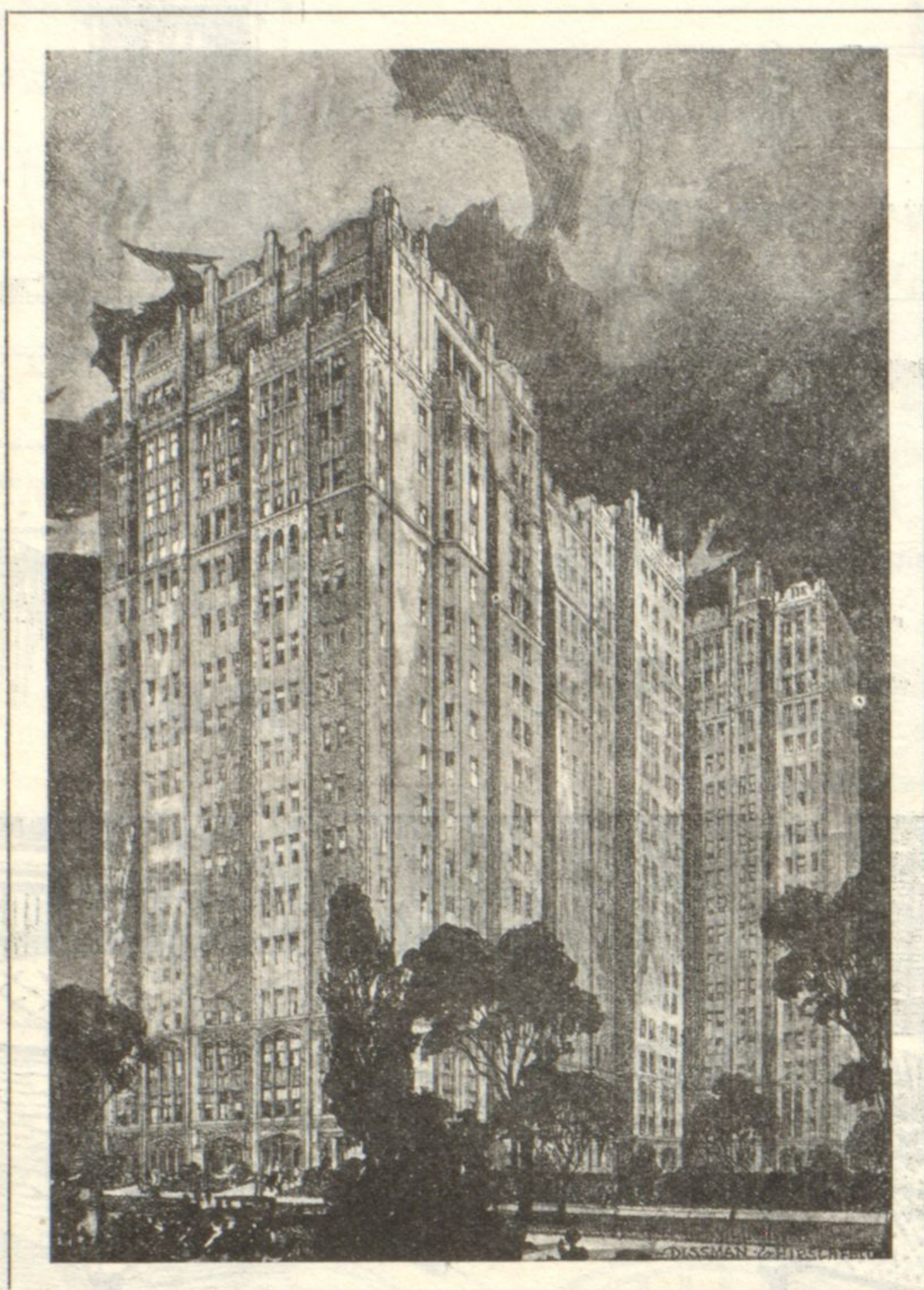
Ready for Occupancy, May First, 1927