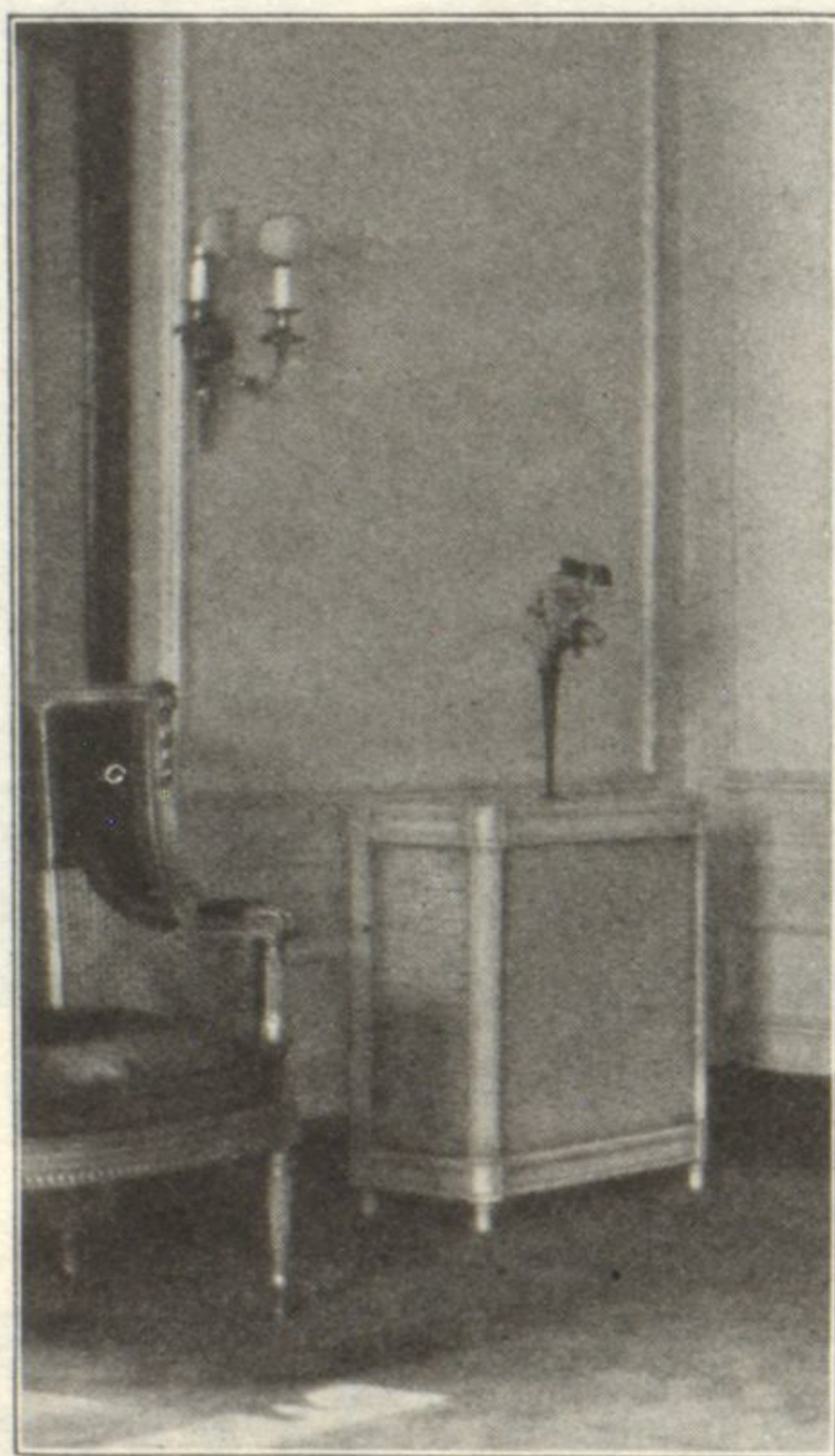
A TYPICAL PARJAN INSTALLATION Photographed at the Blackstone Hotel