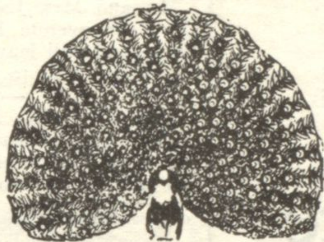
The Most Beautiful Chevrolet