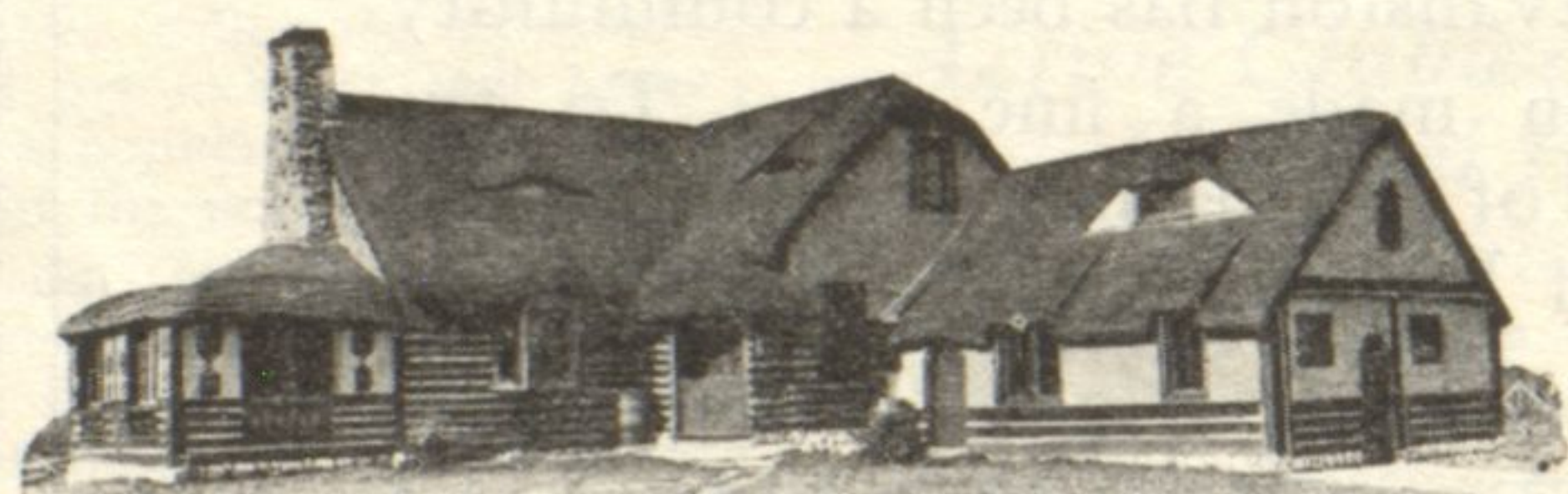
"Builder of Unique Homes"

E. G. Pauling & Co. 5 N. LaSalle St. Main 0250