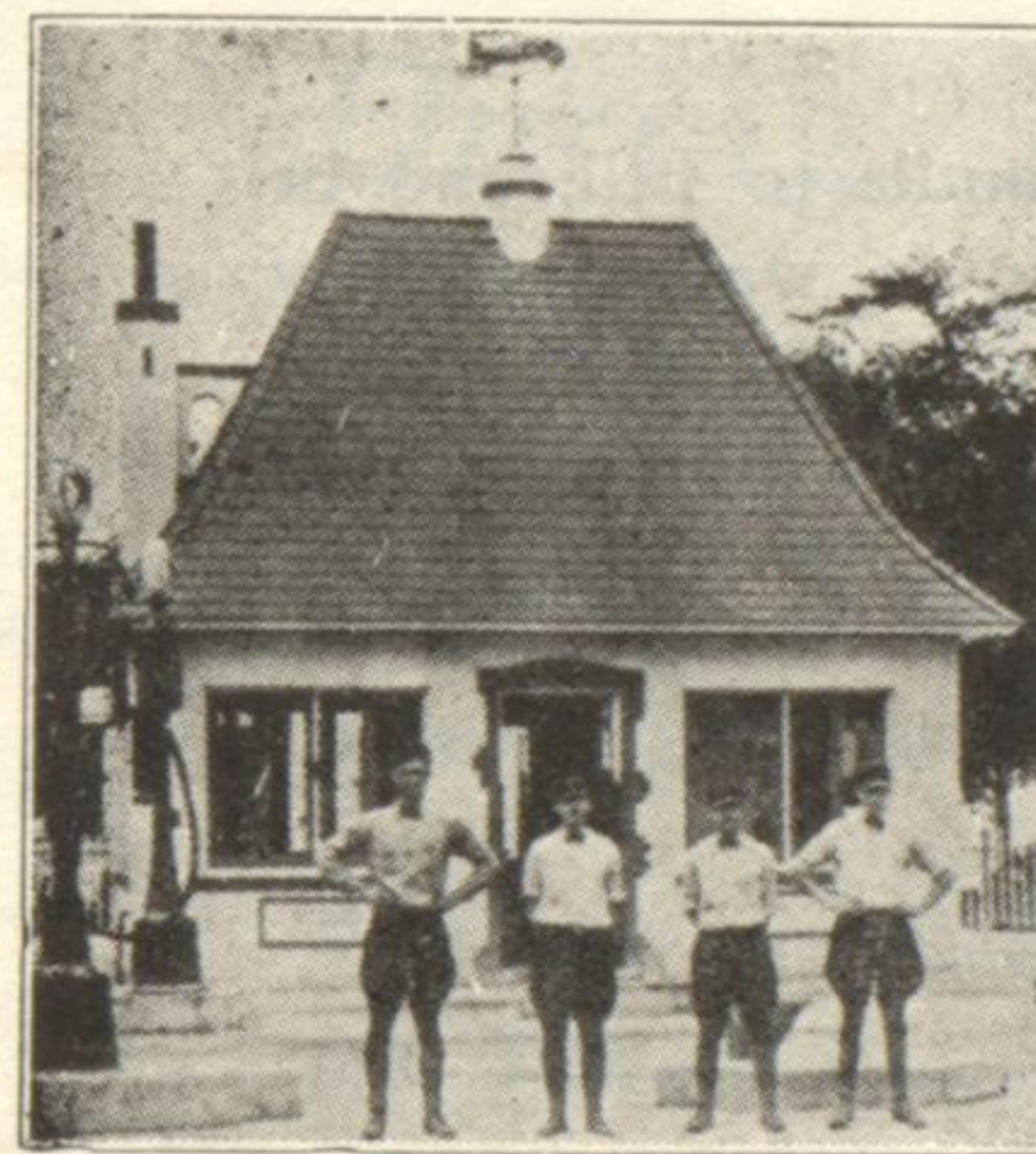
The Red Roof in No-Man's Land Just South of "The Cottage"

Can You Get Your Car GREASED Without Waiting? YES