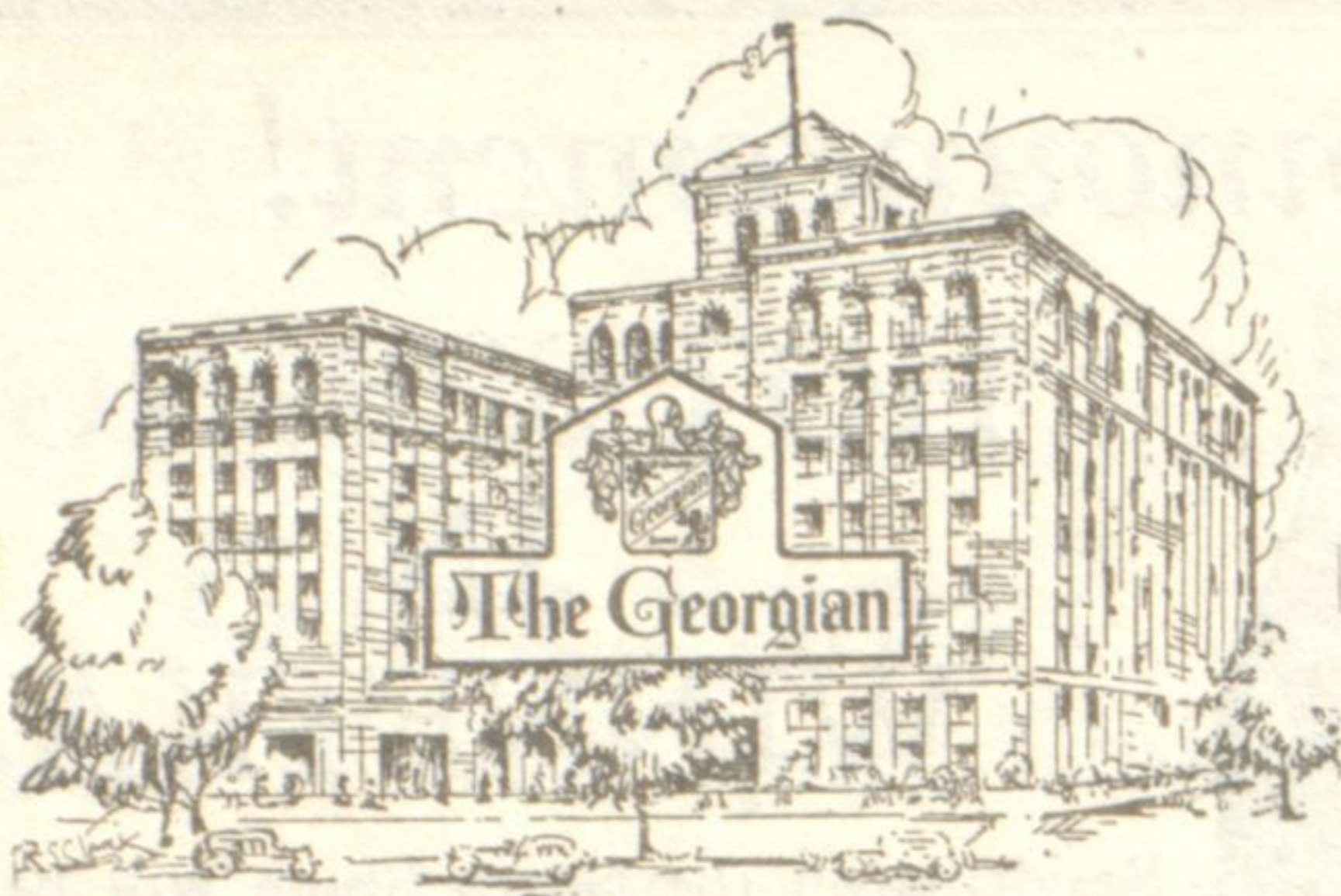
Hinman Avenue at Davis Street—Evanston