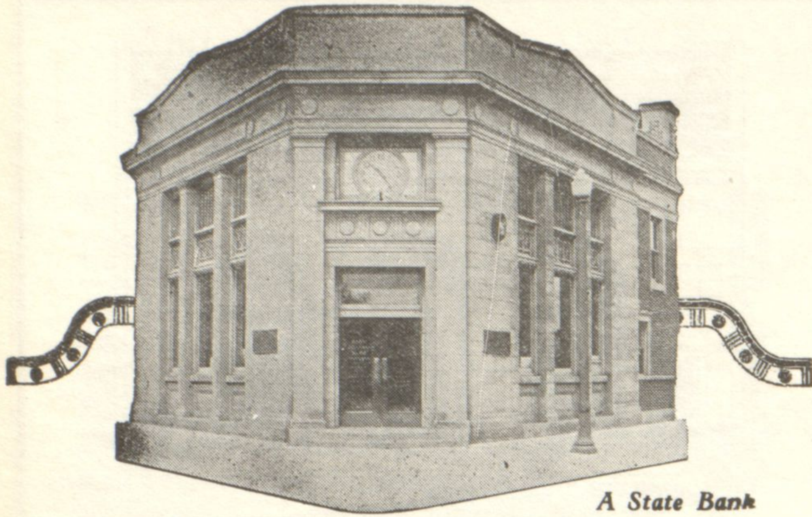
A State Bank