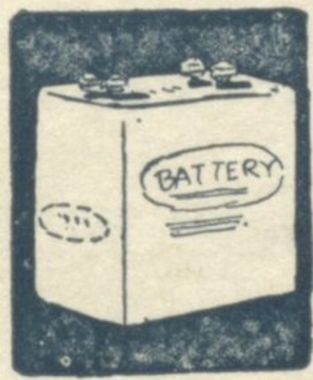
Second Prize National Auto or Radio Battery Value $11.50