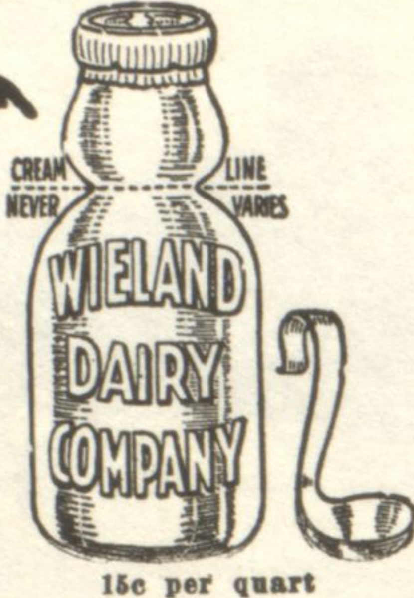
15c per quart

Ask Our Drivers Or Phone Wilmette 3029— Greenleaf 820.