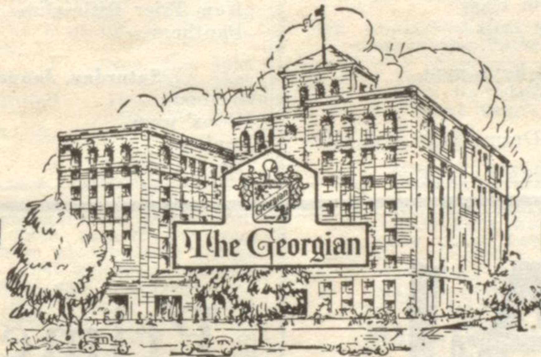
Hinman Avenue at Davis Street—Evanston