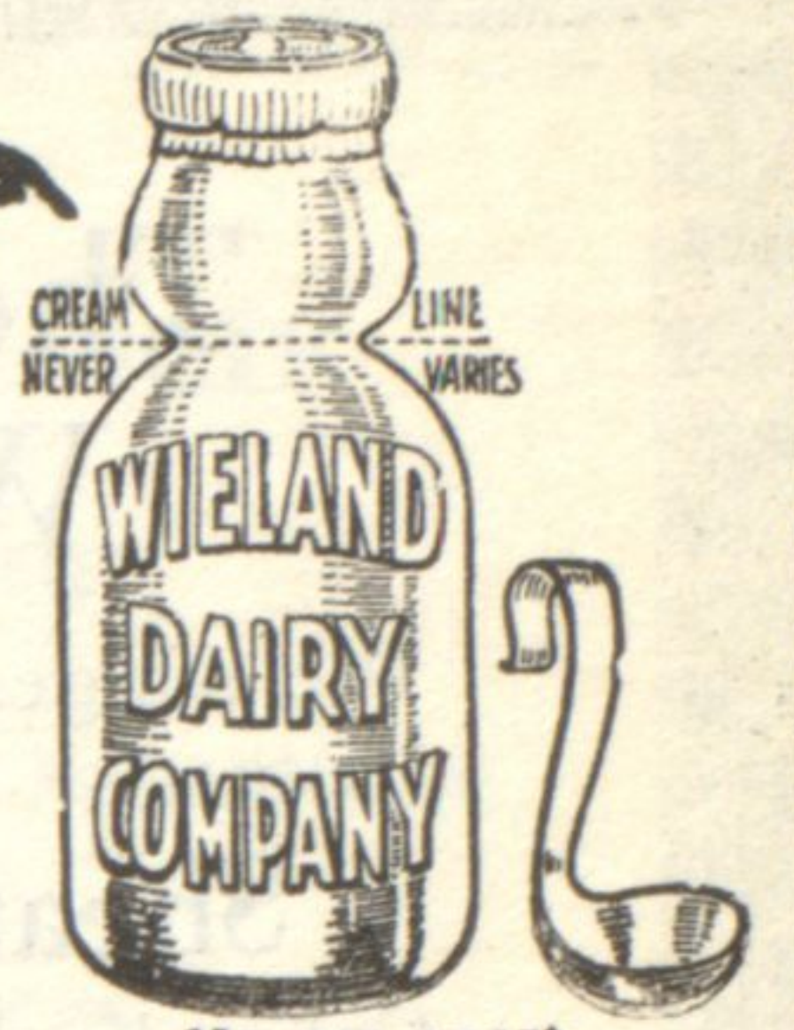
15c per quart

Ask Our Drivers Or Phone Wilmette 3029— Greenleaf 820.