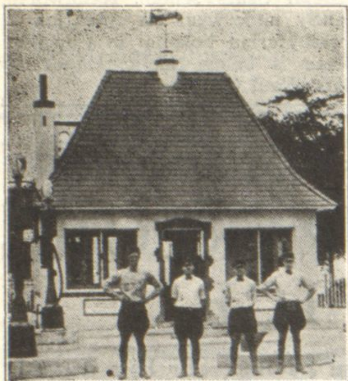
The Red Roof in No-Man's Land Just South of "The Cottage"

DON'T BE IN DOUBT about the strength of the solution in your RADIATOR