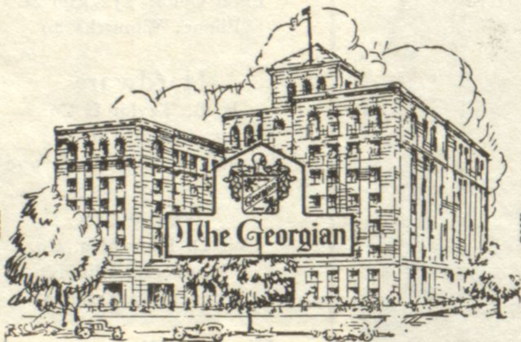
Hinman Avenue at Davis Street—Evanston