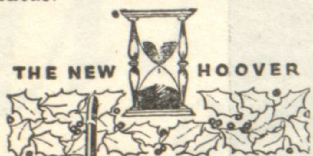
THE NEW HOVER

WHAT a host of wonderful Christmas suggestions is offered by Good Housekeeping Shop in the way of Electrical Appliances! Note the quality of this merchandise, then the advantageous prices and scan this list for suitable ideas.