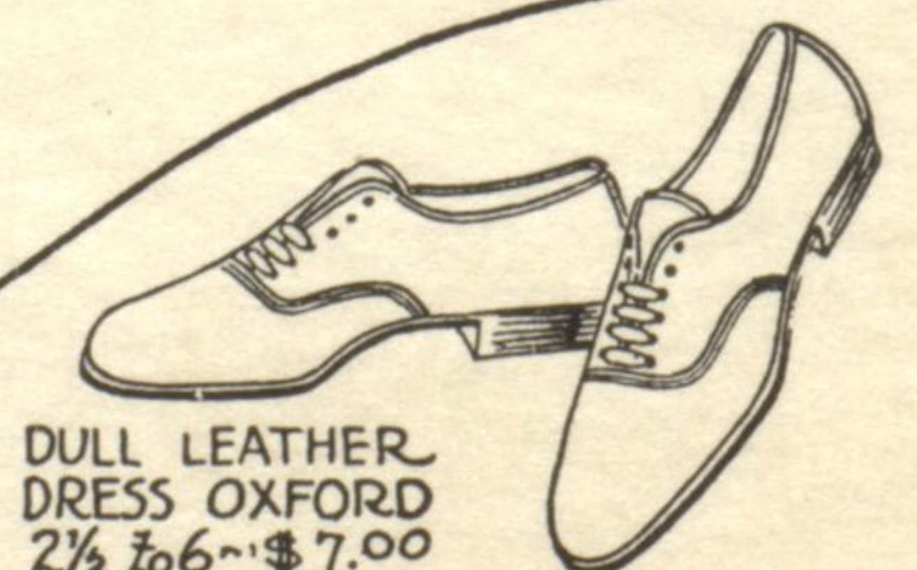
DULL LEATHER DRESS OXFORD 2 1/2 to 6 - $7.00