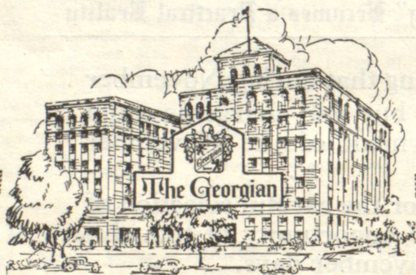
The Georgian at Davis Street and Hinman Avenue

720 Elm St., Winnetka Phone Winn. 254-1470