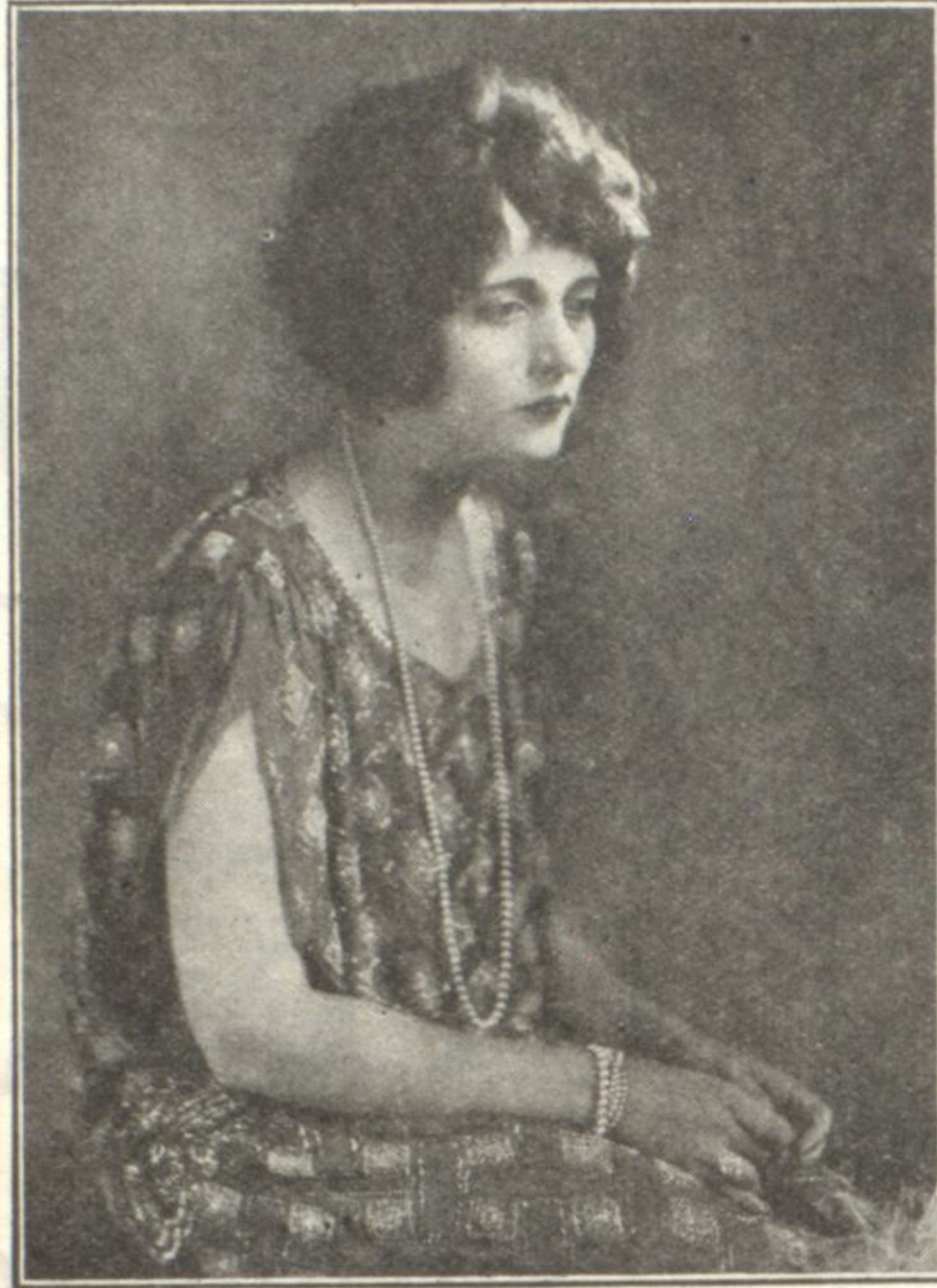
Jessie Royce Landis

Jessie Royce Landis, 931 Judson avenue, Evanston, leading lady of the Otis Skinner company, which has opened at the Blackstone theater, is a native of Evanston. Miss Landis won a scholarship in the Chicago Musical college,