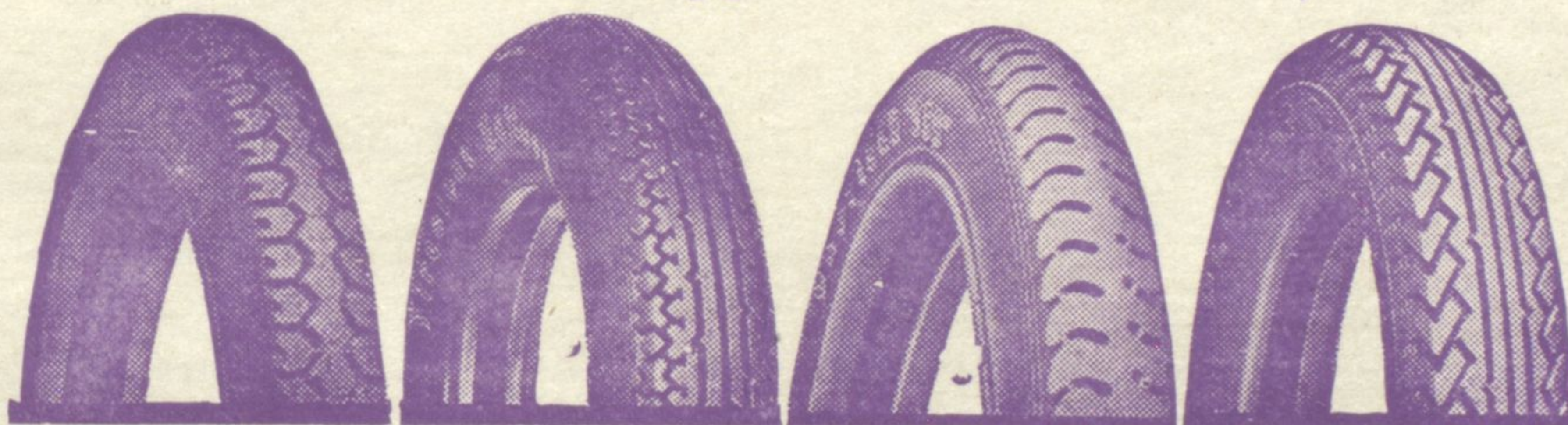
30x3½ Reg. Firestone Gum Dipped Cord

All Sizes of Firestone Gum-Dipped Tires at Greatly Reduced Prices