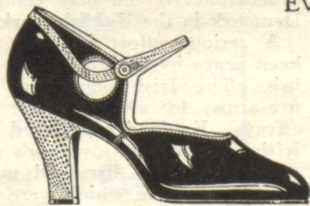
A Foster Afternoon Slipper in Black Antelope with Patent Leather $18.50

DOWNTOWN—115 North Wabash Avenue NORTH SIDE —The Foster Drake Hotel Shop EVANSTON —Orrington Ave. at Church St.