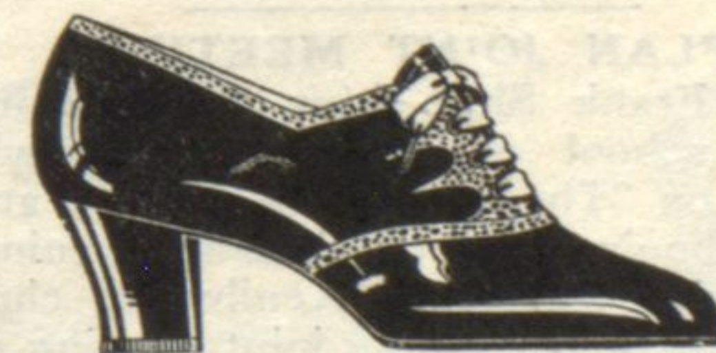
A Foster "CAMPUS" Oxford in Black Antelope with Black Calf Trimming $12.50