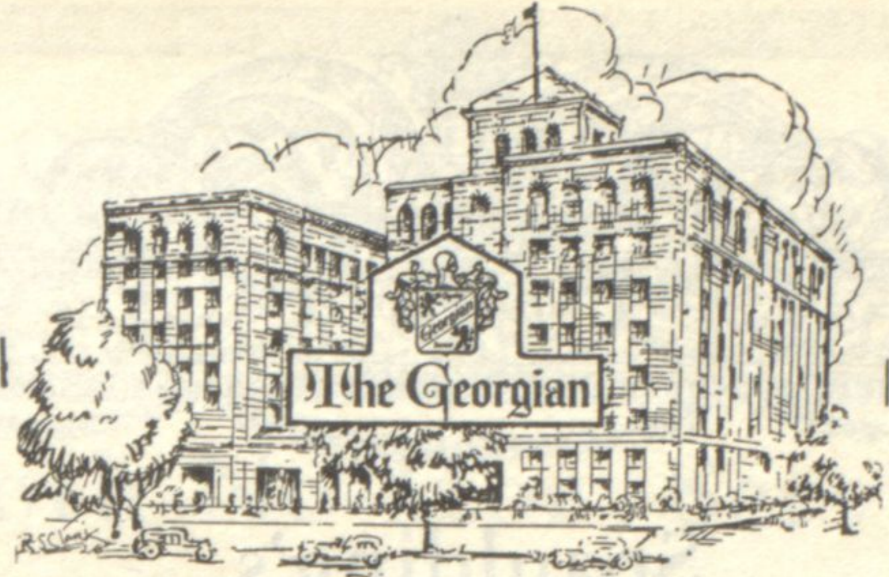
The Georgian at Davis Street and Hinman Avenue

CEMETERIES BY LAKE VIEW STATE BANK MAUSOLEUM BY UNION TRUST CO.