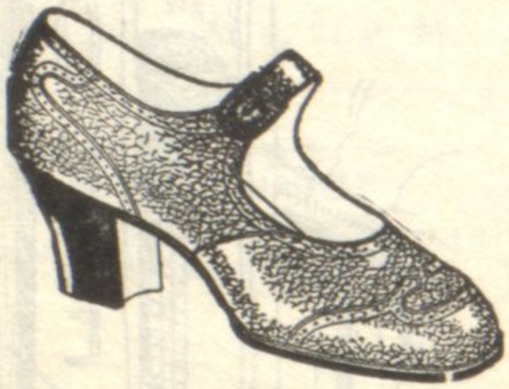
Black and beige reptile—and tan calfskin. Oxidized buckle; cuban heel. Perforated and stitched trimmings.

—a clever brogue for those who like shoes of youthful line