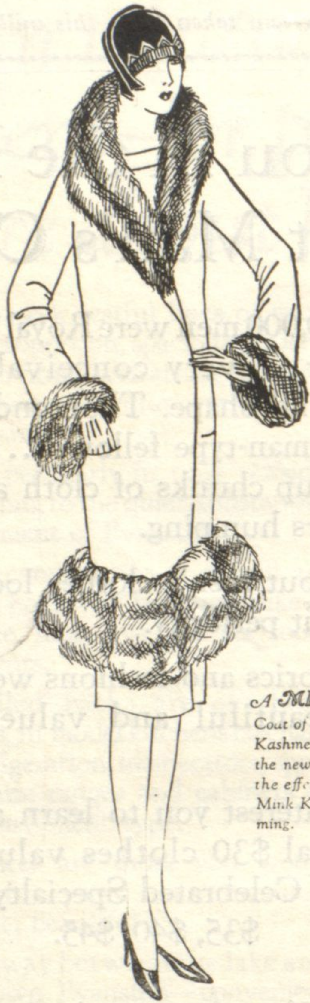
A MILGRIM Coat of Lacquer Red Kashmere portraying the new "flare" and the effectiveness of Mink Kolinsky trimming.

MILGRIM PARIS NEW YORK 600 MICHIGAN BOULEVARD, SOUTH CHICAGO