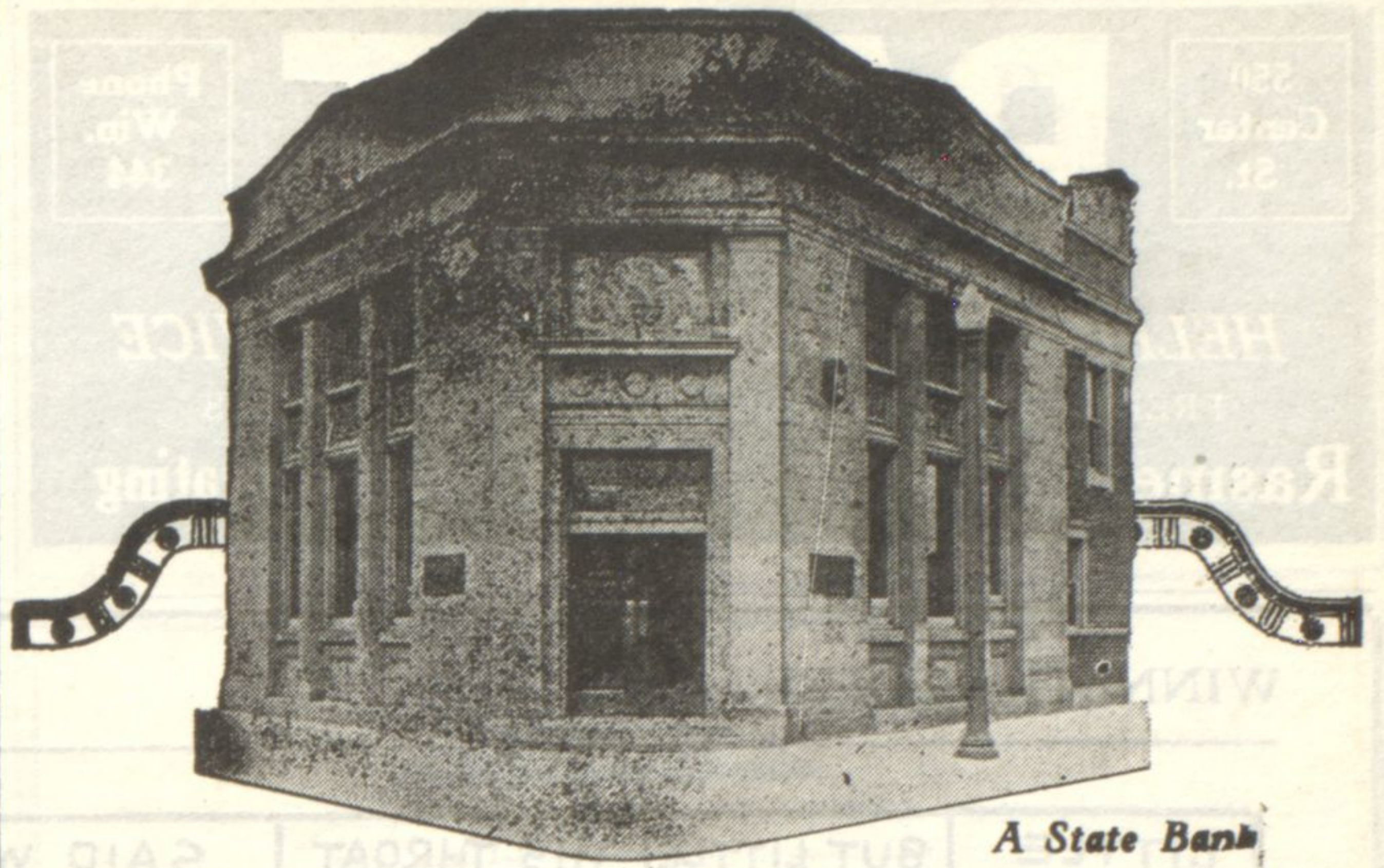
A State Bank