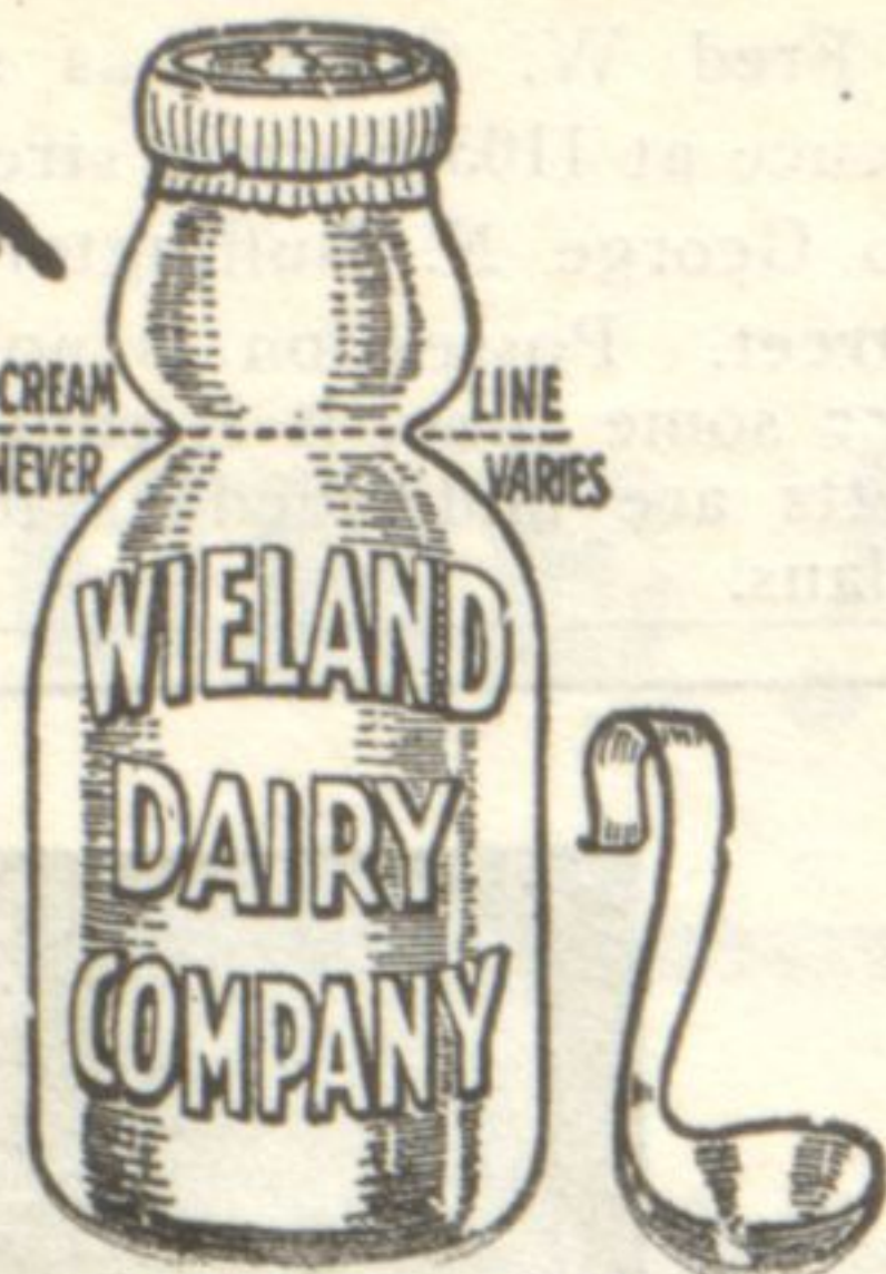
15c per quart

The cream taken from this milk will whip