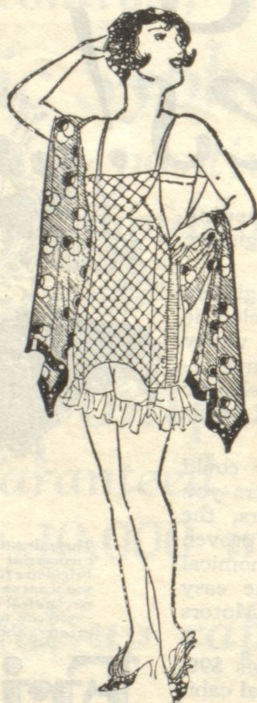
Showing in the West Room, Second Floor

Absolutely new, a hookless garment that saves you time and brings new-found comfort. Broche and fancy silk striped madras lends to beauty.