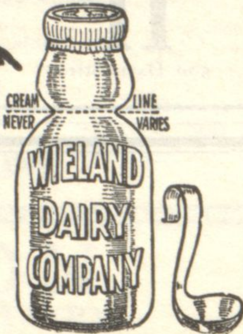
15c per quart

The cream taken from this milk will whip