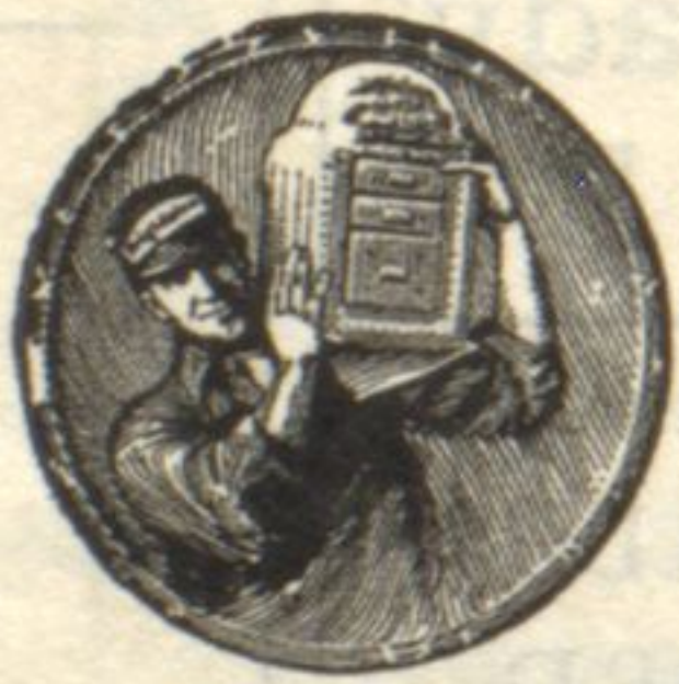
"This modern 'ice man' calls once—with Frigidaire—and the ice stays always"

Frigidaire—product of General Motors—is made and guaranteed by Delco-Light Company, the world's largest builder of electric refrigerators. It is easy to buy. A reasonable payment down puts it into your home—and the remainder may be absorbed monthly on the GMAC payment plan. Call—phone—or mail the coupon for information about the new metal cabinet Frigidaire or the mechanical unit that will make a Frigidaire of your present ice-box.