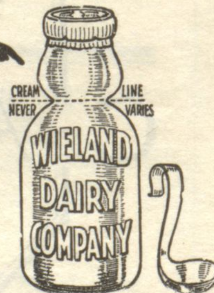
15c per quart

The cream taken from this milk will whip