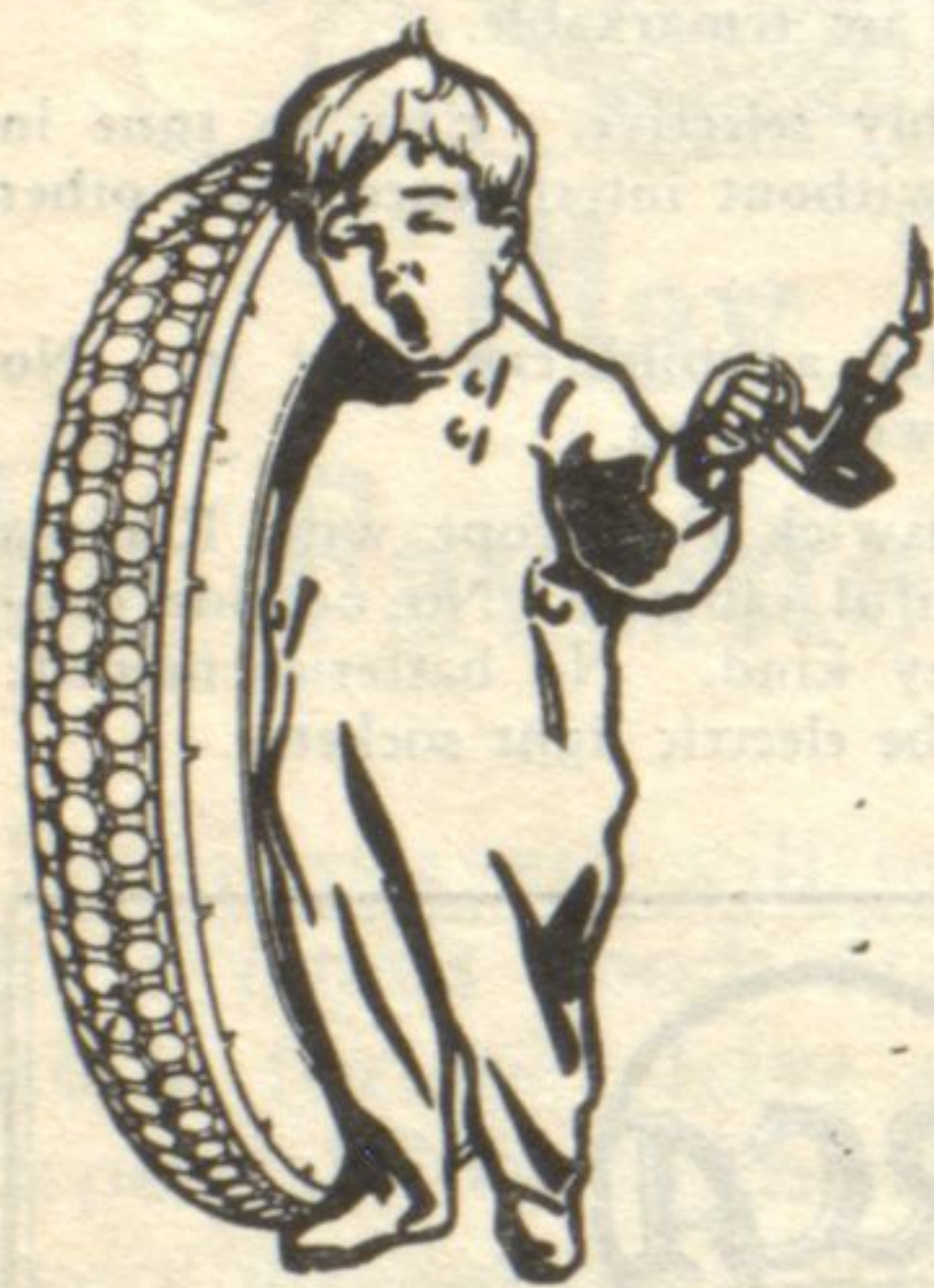
Trade Mark Reg. U. S. Pat. Off. Time to Re-tire? (Buy Fisk)