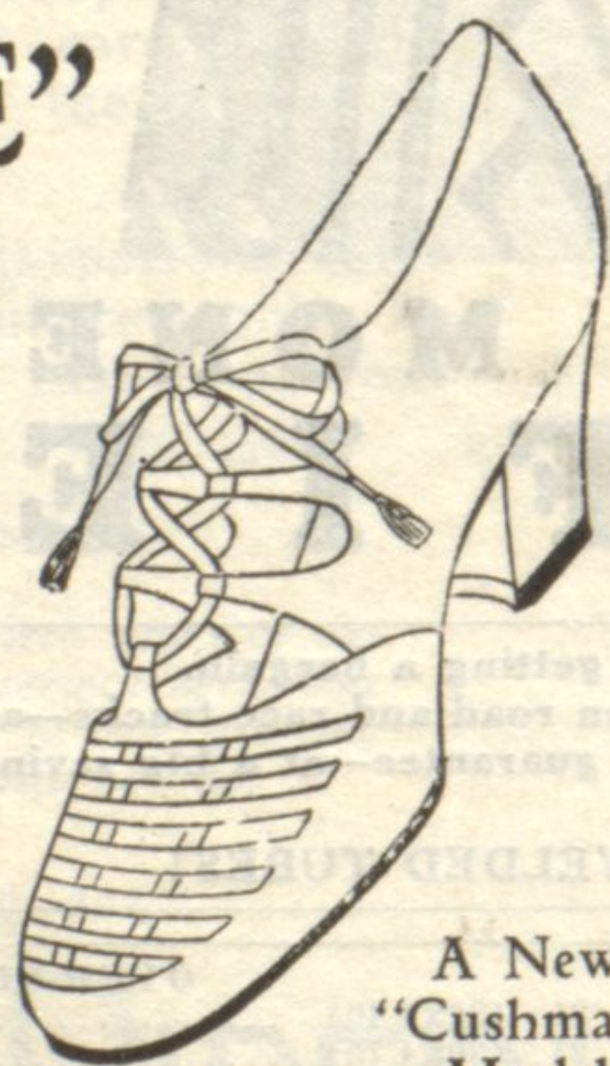
A New "Cushman" Model

This fascinating new shoe is sure to be the hit of the season with the younger set. Its features are! Full round short vamp! Basket weave effect of narrow interwoven strips of leather! And open instep formed by three narrow straps, set wide apart, and fastened with silk lacings.