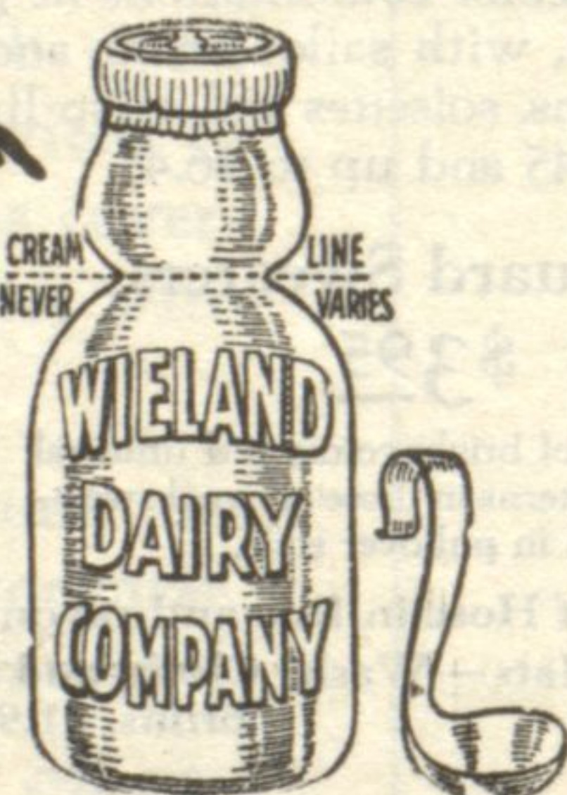
15c per quart

The cream taken from this milk will whip