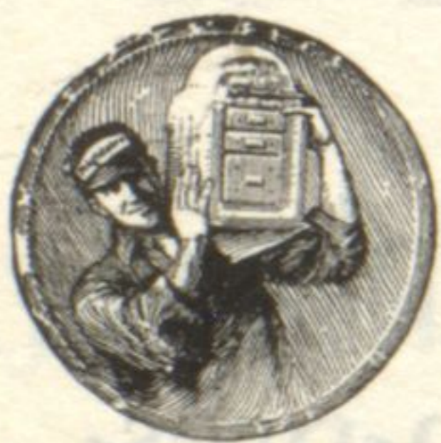
This modern "ice man" calls once—with Frigidaire—and the ice stays always

Come in and see Frigidaire work. See why it has 150,000 users who wouldn't do without it. Find out how easily it's bought on the GMAC time payment plan. Telephone or write for the Frigidaire Catalogue.