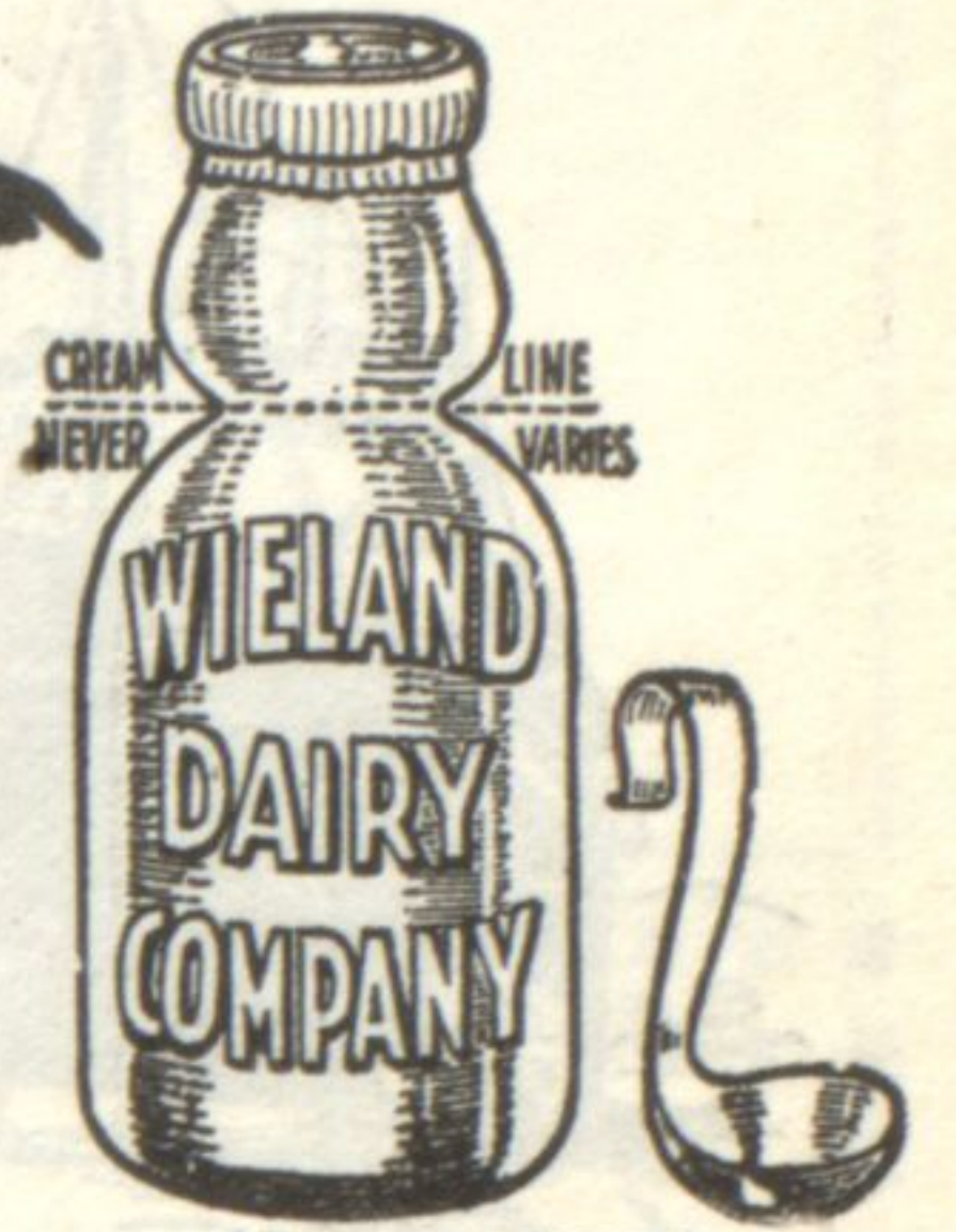
15c per quart

The cream taken from this milk will whip