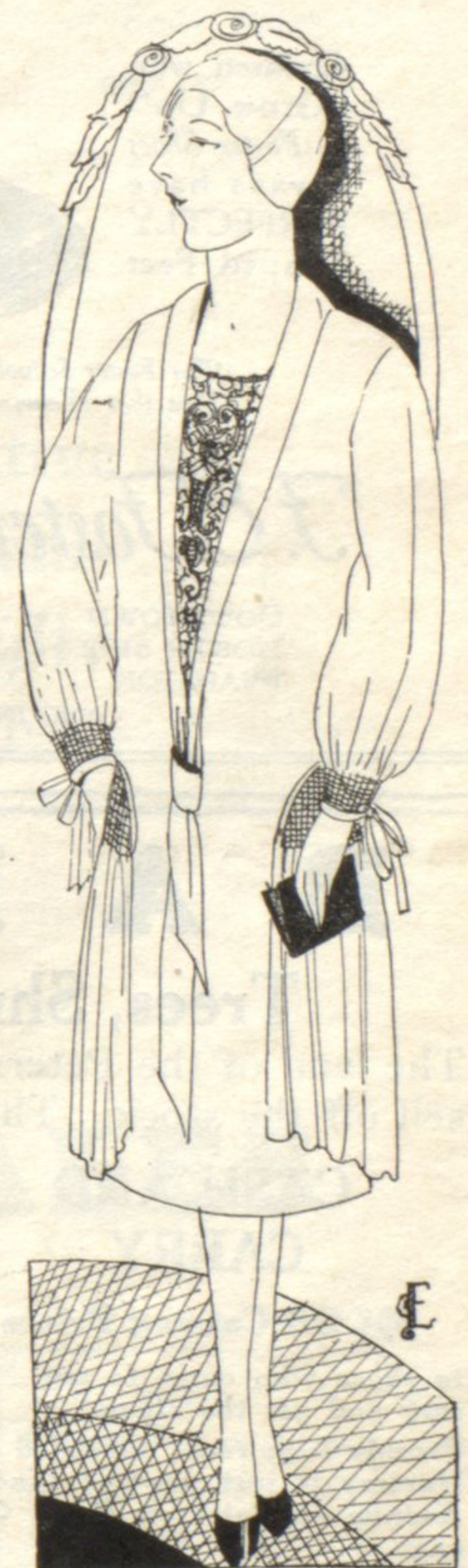
PICTURED AT RIGHT E—A tan georgette frock with side panels shirred at the top and with full puff sleeves shirred into a narrow cuff. The vestee is of heavy embroidery. The panels at the side are shirred, $17.50.

Rosenberg's Women's Apparel—Second Floor