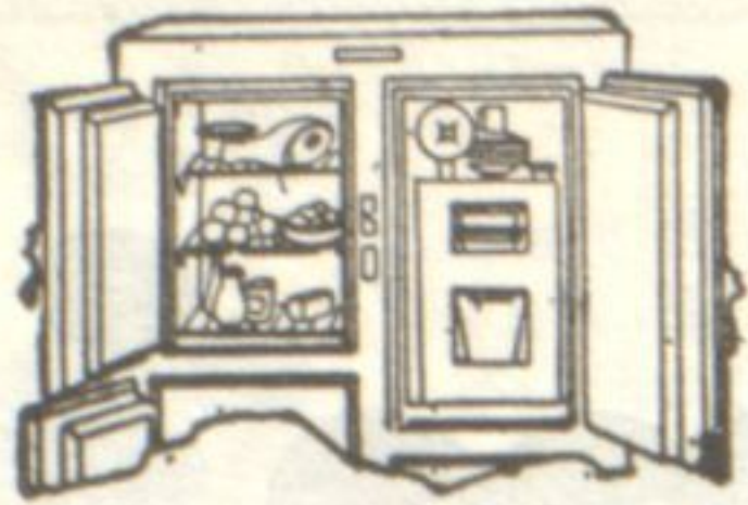
Fits Any Refrigerator