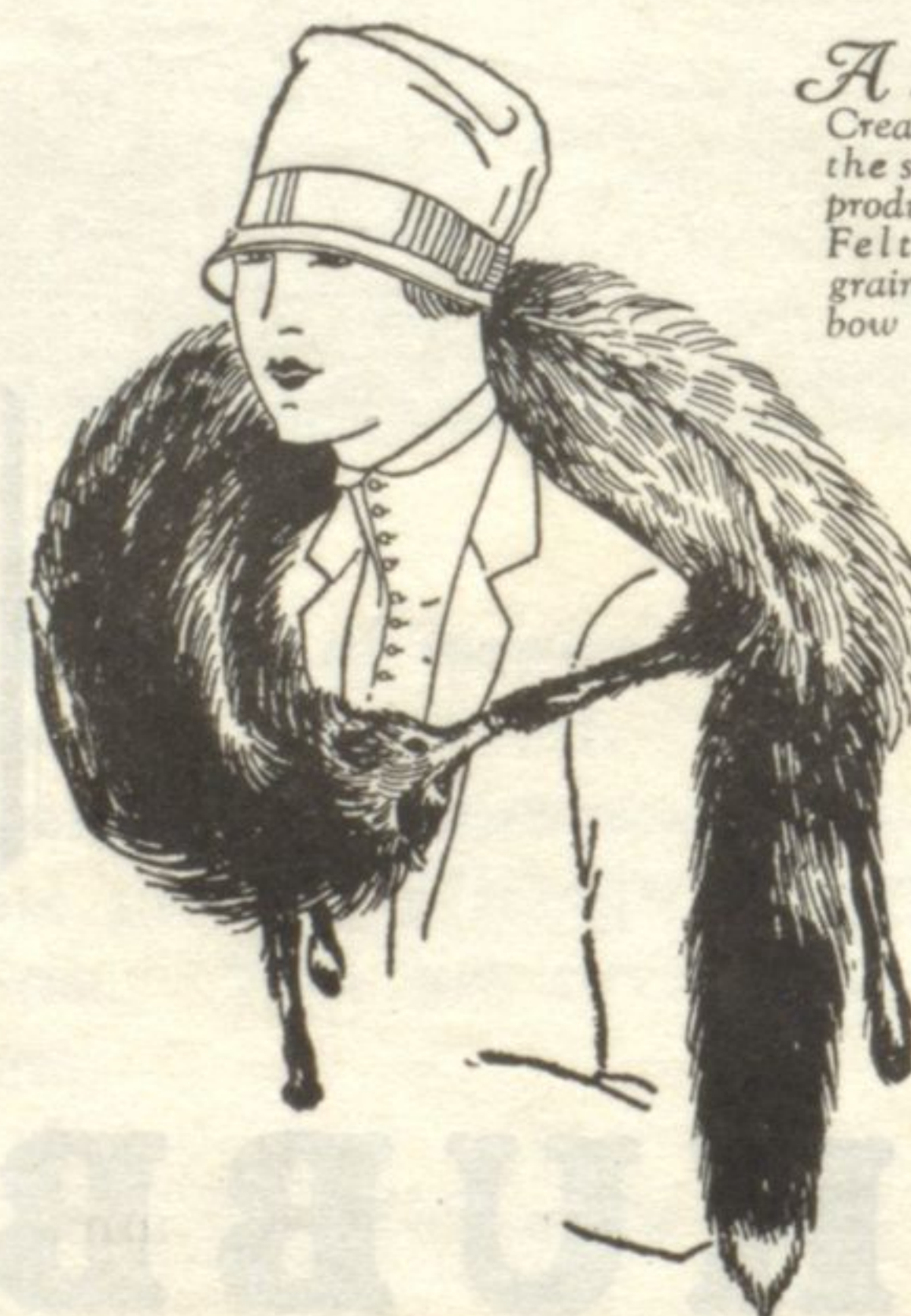
A MILGRIM Creation featuring the small brim—produced in Green Felt with gros-grain ribbon and bow . . . $22.50