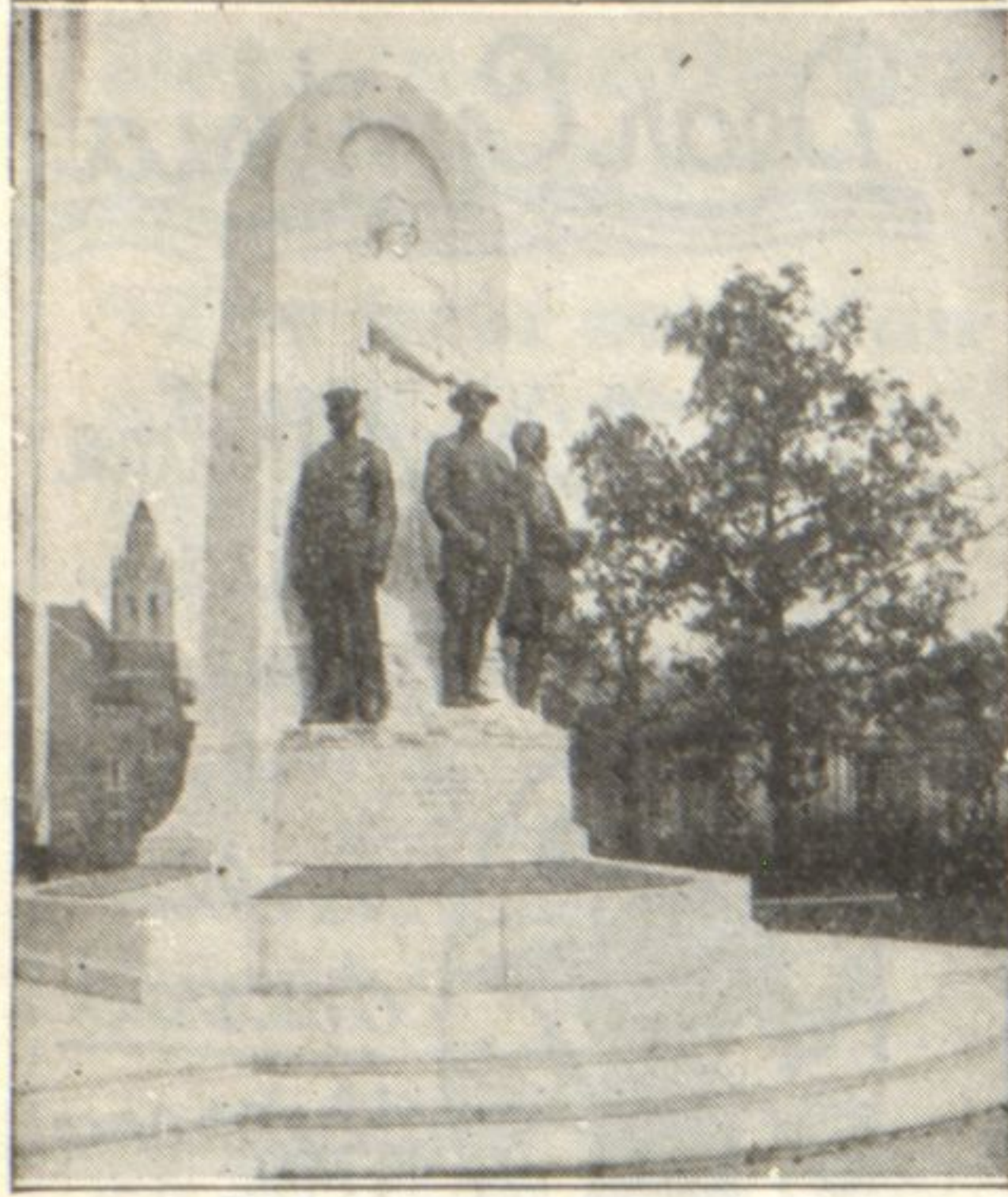
Soldiers' Memorial, Oak Park Granite Cut and Erected by J. H. ANDERSON MONUMENT CO. We make the Better Class Memorials 5751 Ravenswood Avenue Write for Catalogue