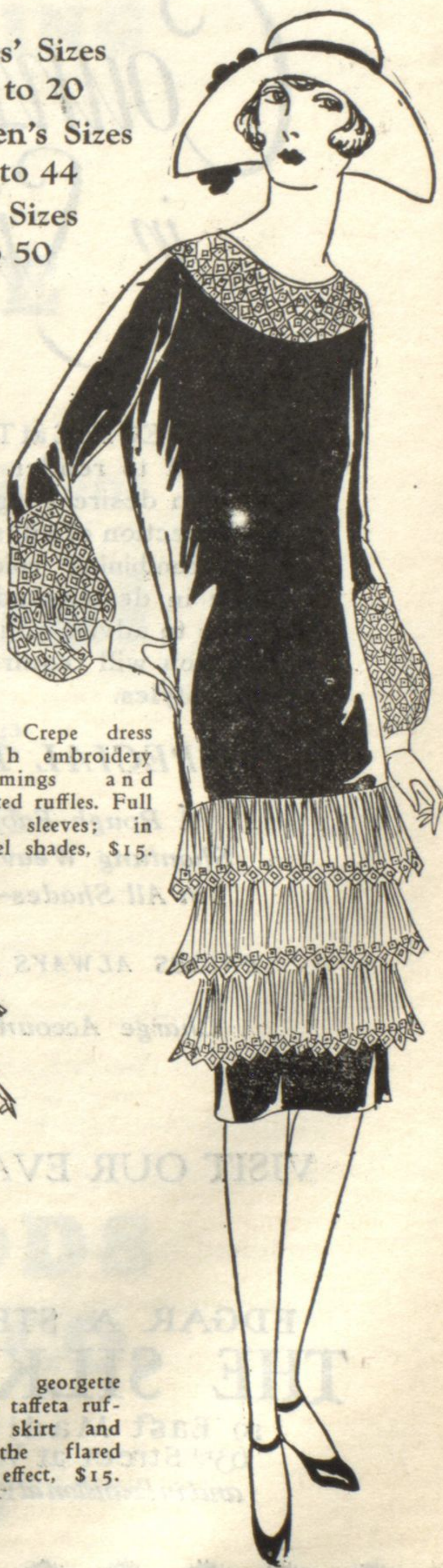
Flat Crepe dress with embroidery trimmings and pleated ruffles. Full puff sleeves; in pastel shades, $15.