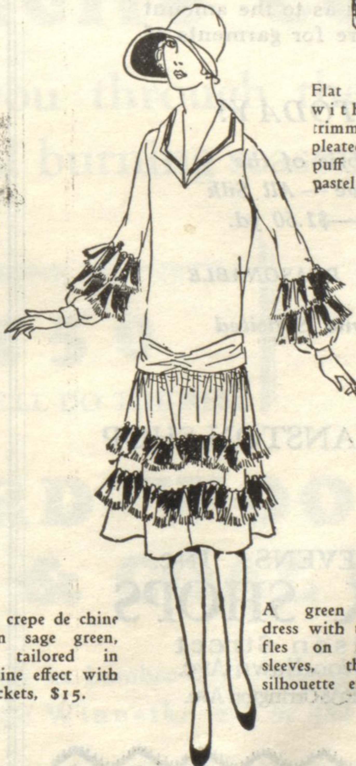
A green georgette dress with taffeta ruffles on skirt and sleeves, the flared silhouette effect, $15.