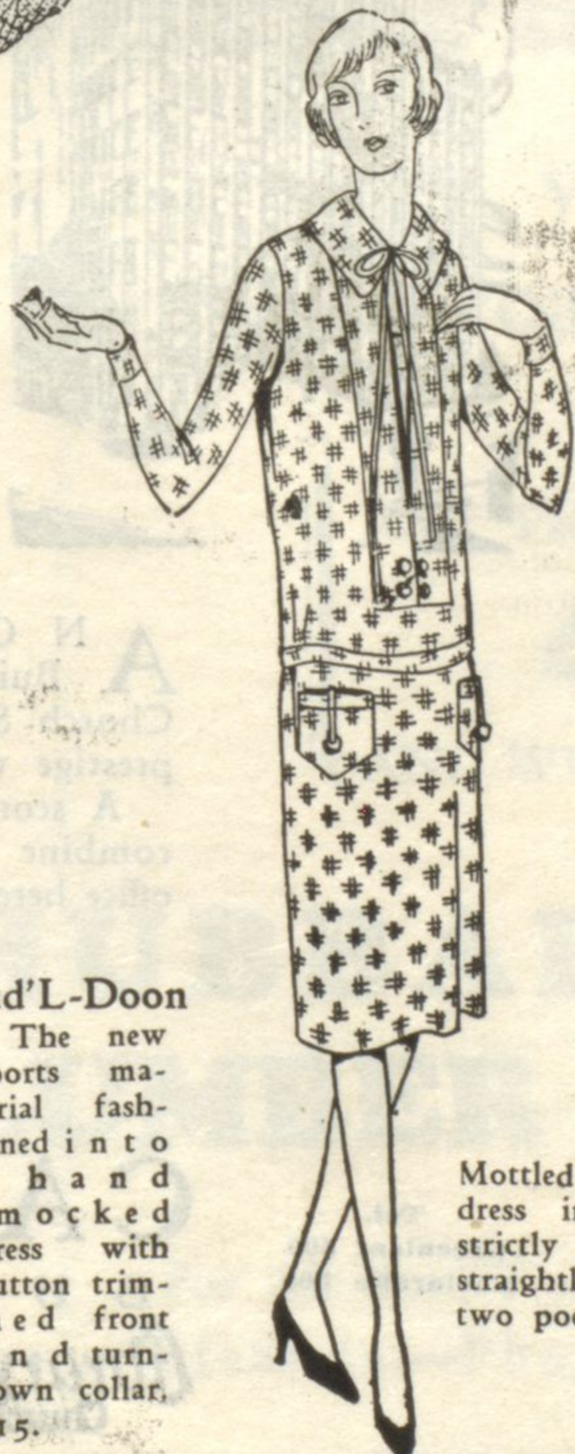
Mottled crepe de chine dress in sage green, strictly tailored in straightline effect with two pockets, $15.