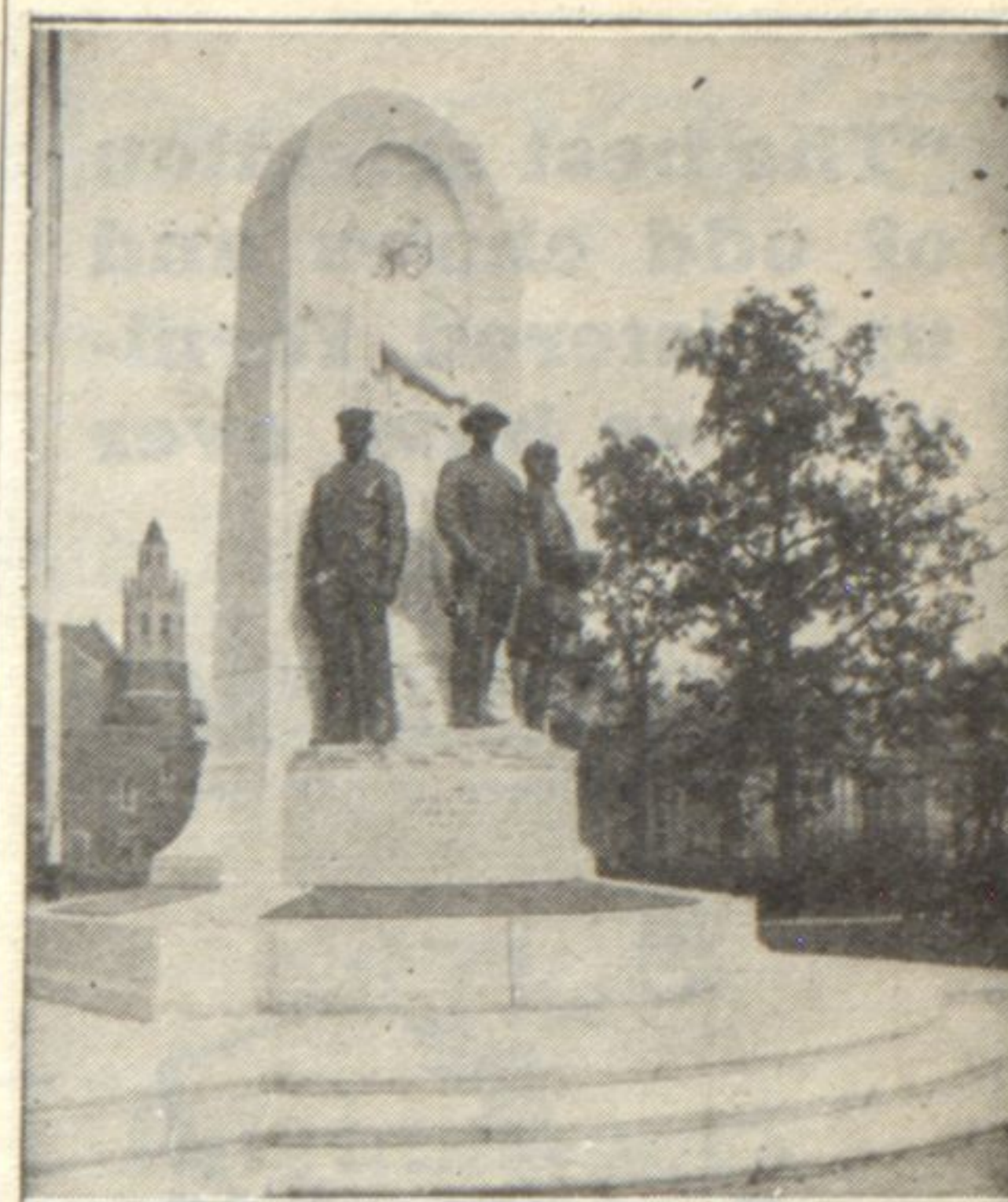
Soldiers' Memorial, Oak Park Granite Cut and Erected by