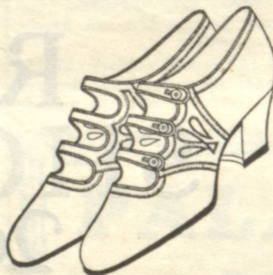
ROSE MARIE (above)

A neat one strap model. Fits up snug through the instep. For afternoon and evening wear. This style may be had in patent leather or black satin.