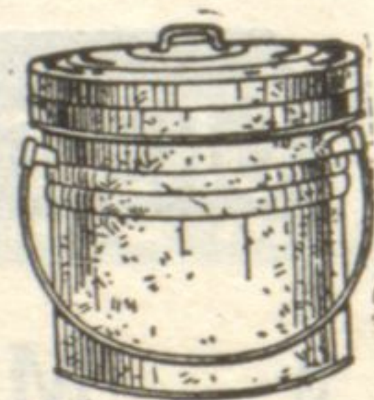
Garbage Pails, ea. 85c