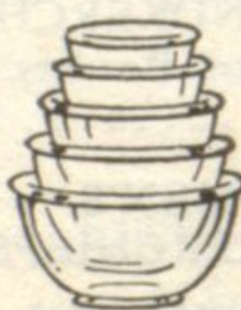
Mixing Bowls Glass, set of 5, 75c