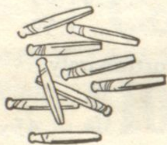
Good Quality Clothes Pins per doz., 5c