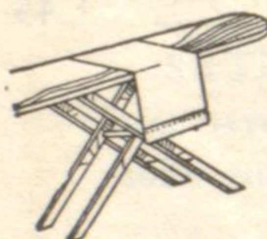
Rid-Jid Ironing Board, $2.95

During the entire month of January we are selling, at reduced prices, many articles that are constantly needed in every home.