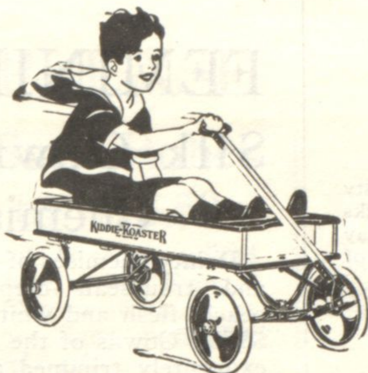
A coaster wagon, steel, red or green $6.75 to $8.50