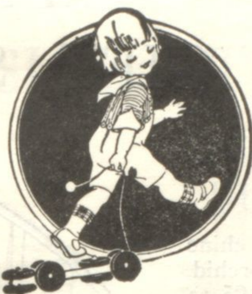
Lots of fun with Follo-Me Tinker $1.00

An Inkling of Toys That Will Make Happy Girls and Boys