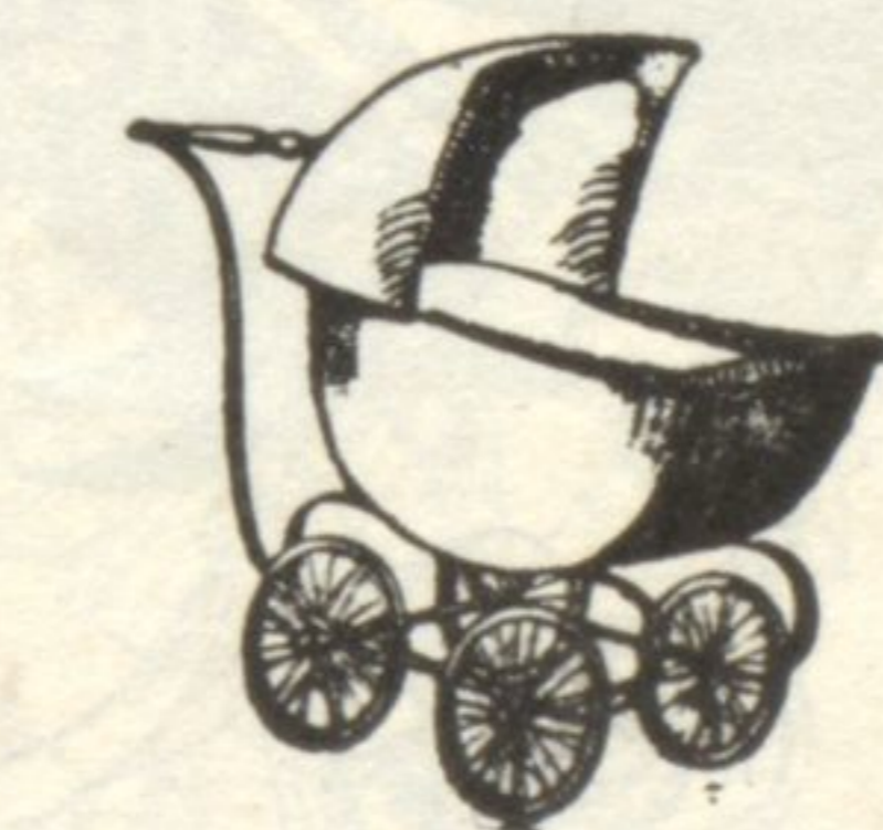
To rock Mary's doll to sleep in, a doll buggy $3.50 to $17.50