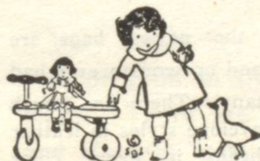
A toy for outdoors and in- doors, Kiddie Kar $3.50 to $4.50