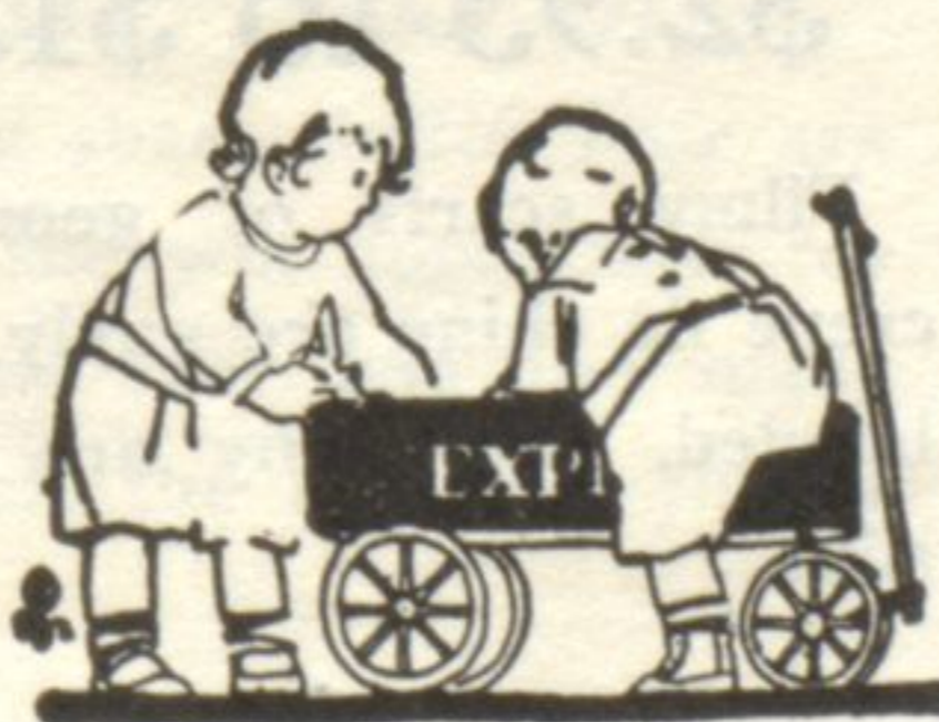
For the tiny tots, a small express wagon $1.35