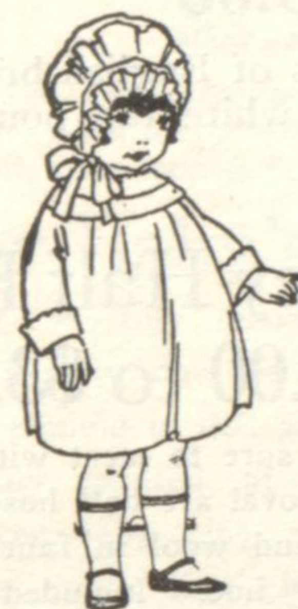
For Mary, who has been a real good girl, a big doll $7.50