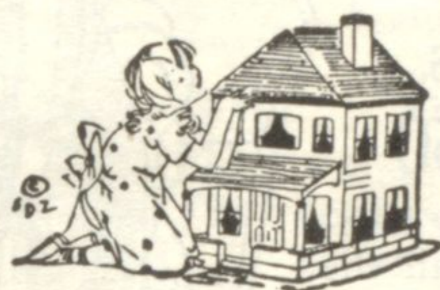
A doll house for Mary's doll $1.25