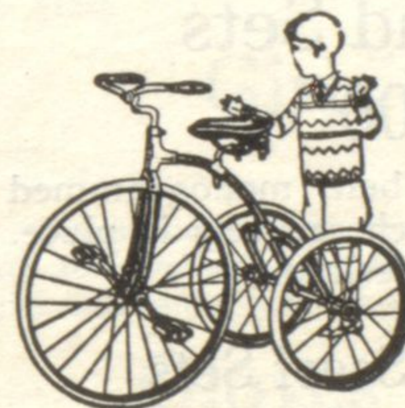
For Tommy, who has been a real good boy, a velocipede $9.00 to $17.50