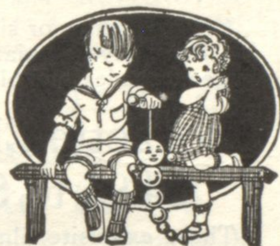
A funny toy, made of many brightly colored balls, is Siren Tinker