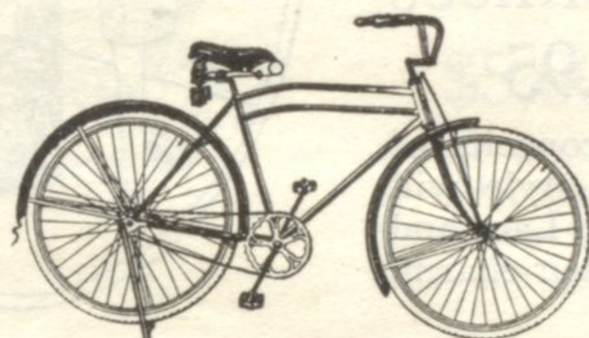
Johnny can ride this bicycle to school $25.00 to $47.50