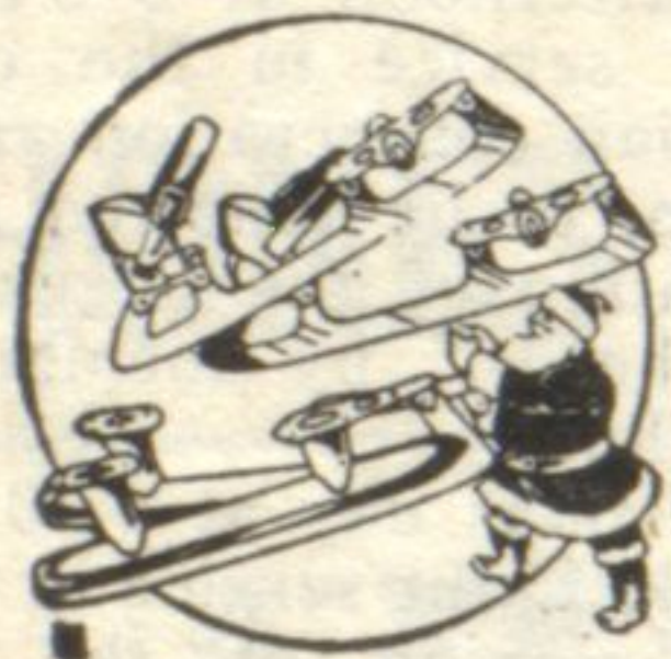
Alfred Johnson's Shoe Skates $7.25 to $10.00 Union Hardware Clamp Skates