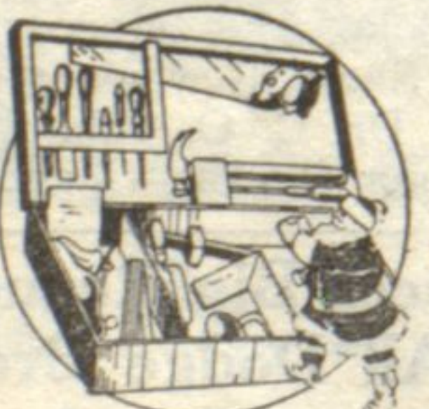
Stanley Tool Sets and others Just the thing for Boys and Men $1.00 to $25.00