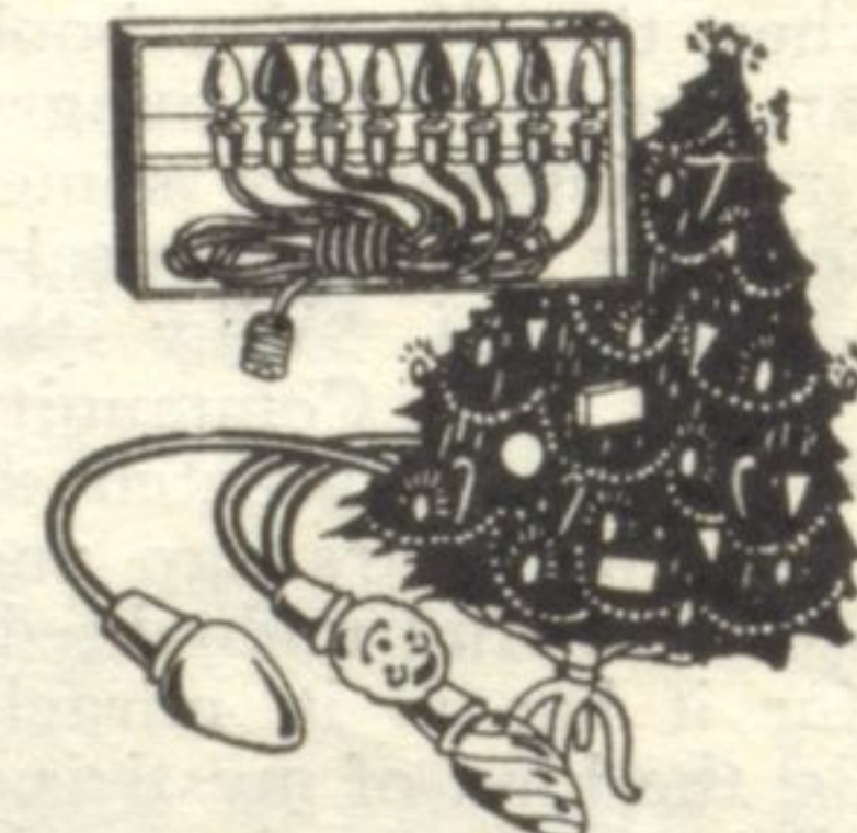
Lights and Stands for the Tree We have only the best

The Store for Toys 735 Elm Street Open Evenings Until Xmas