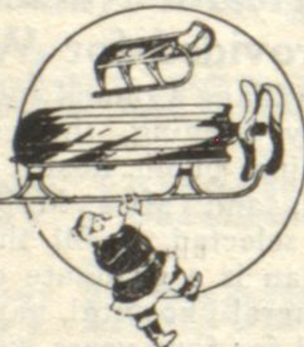
Flexible Flyers The sled that is second to none.