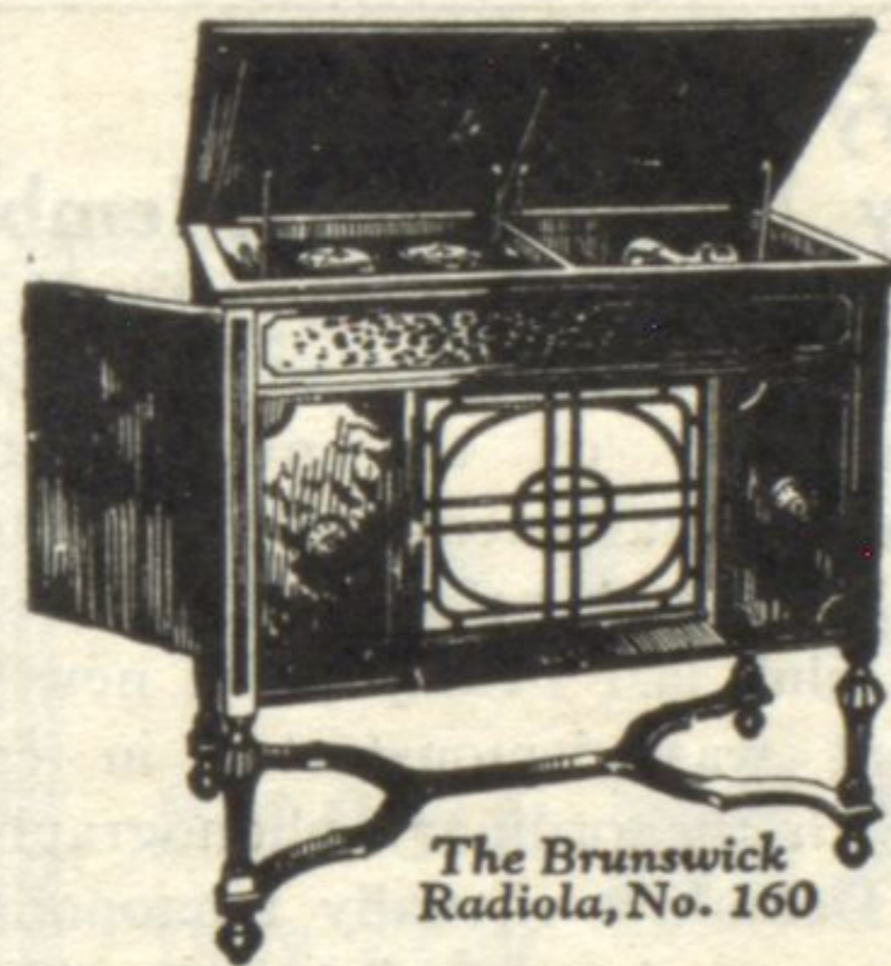
The Brunswick Radiola, No. 160

Bring all the wonderful world to you in this way