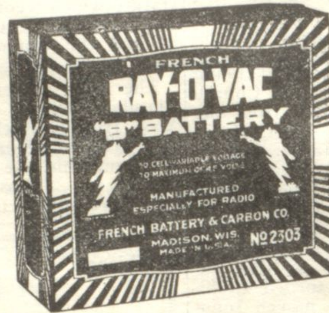
Ray-O-Vac No. 2303 45 Volt Vertical, $3.75